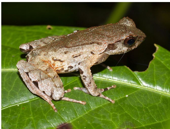
Fig. 1. A male Zunheboto Horned Frog ( Xenophrys zunhebotoensis ) from Hmuifang, Mizoram, India (MZUHC 30036).

the high genetic diversity between X. zunhebotoensis from Nagaland and Manipur. However, without any diagnosable morphological distinction between the two populations, the Manipur population is treated as conspecific with X. zunhebotoensis (Mahony et al. 2020). Herein, we present the first record of this species from the state of Mizoram and also