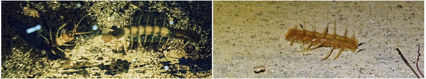
Fig. 2. Separated head and remaining segments of an Indian Tiger Centipede ( Scolopendra hardwickii ) after one day of scavenging by Indian Bullfrog ( Hoplobatrachus tigerinus ) tadpoles (left) and remnants of the exoskeleton after the second day (right).

the centipede. By the next day, the head of the centipede had been detached and a few segments had been eaten, and by the second day, the entire centipede had been devoured and only the exoskeletal remains of a few segments were left (Fig. 2).