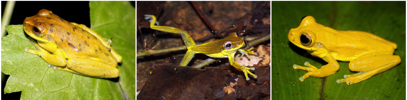
Fig. 4. A previously unrecorded coloration pattern for the Hispaniolan Yellow Treefrog ( Osteopilus pulchrilineatus ) consists of irregular dark brown spots and blotches on the back (left); typically colored individuals with a uniformly brown (center) or yellow (right) dorsum on which three yellow dorsal lines are often present.

Two of the Hispaniolan Yellow Treefrogs exhibited a pattern that, to the best of our knowledge, is a new unrecorded coloration pattern for the species (Fig. 4). The typical pattern consists of a uniformly brown or yellow dorsum usually bearing three dorsal lines in various shades of yellow; the lower flanks are yellow and the belly is white to cream (Díaz et al. 2014; Galvis et al. 2016). In contrast, the previously undocumented pattern consists of irregular dark brown dorsal spots and blotches. Two frogs with the newly described pattern were deposited in the Museo Nacional de Historia Natural “Prof. Eugenio de Jesús Marcano” (MNHNSD 23.3893–4). Additional individuals and tadpoles were collected and donated to the Parque Zoológico Nacional, Santo Domingo, República Dominicana. The identity of the frogs was confirmed by Sixto Inchaústegui.