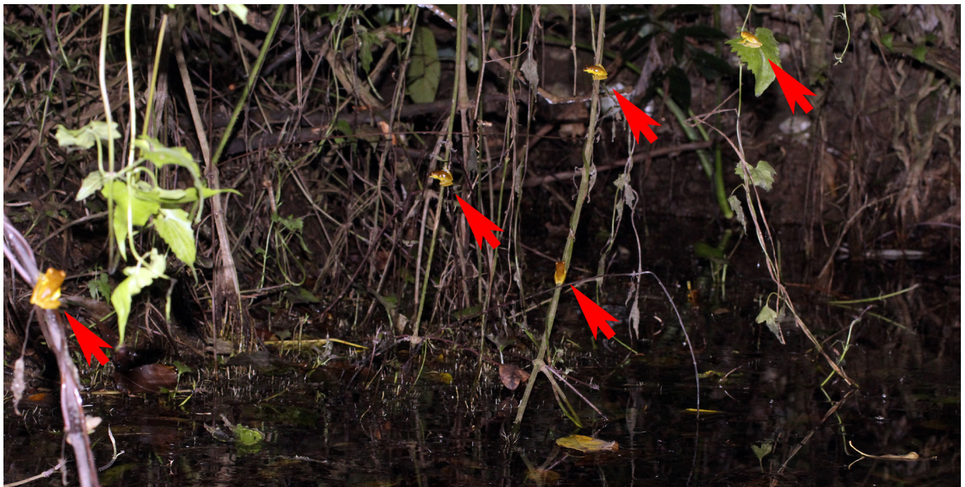
Fig. 3. Seven Hispaniolan Yellow Treefrogs ( Osteopilus pulchrrilineatus ) were active in close proximity to one another at Rancho de la Guardia, Hondo Valle, Elías Piña, República Dominicana. Five are visible in this image.