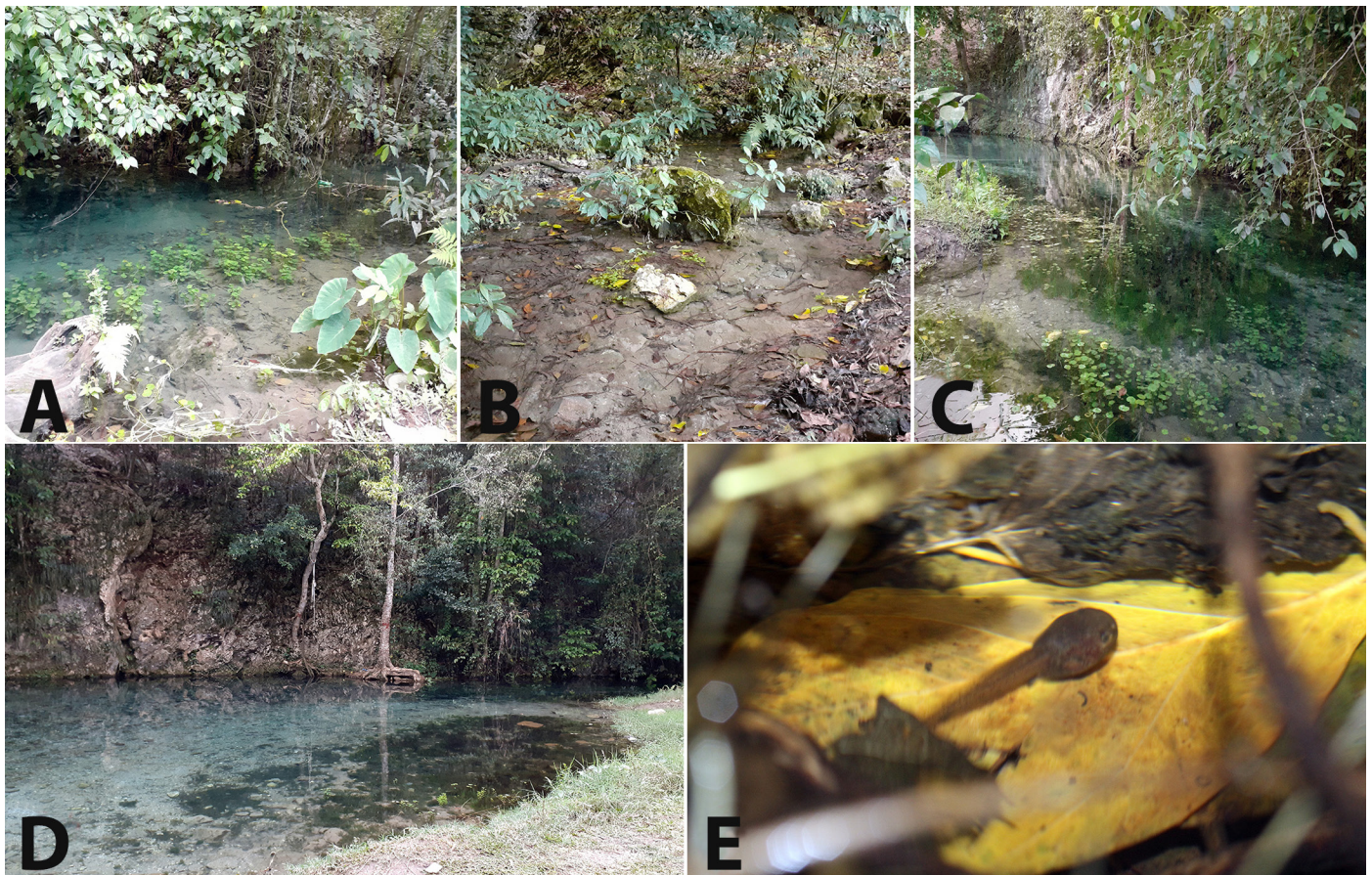
Fig. 2. Habitat at Rancho de la Guardia, Hondo Valle, Elías Piña, República Dominicana, a new locality for the Hispaniolan Yellow Treefrog ( Osteopilus pulchrrilineatus ) (A–D). A larval Hispaniolan Yellow Treefrog at the site (E).