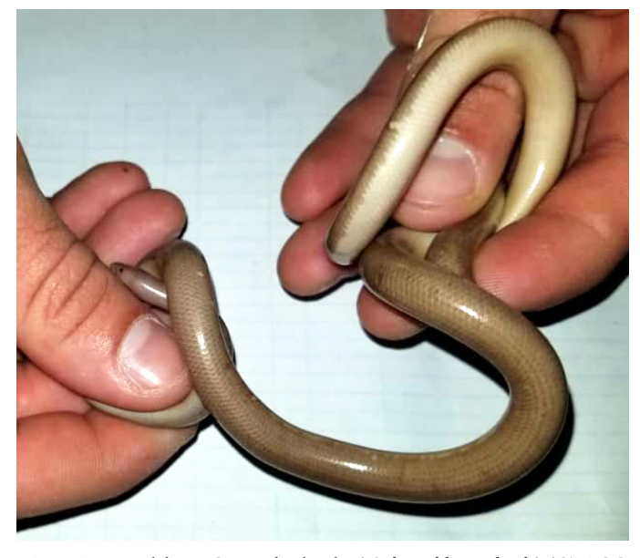
Fig. 1. A Pinar del Rio Giant Blindsnake ( Cubatyphlops golyathi ) (CZACC 4.13365) from Cueva Tapiada in Santo Tomás, El Moncada, Viñales Municipality, Pinar del Río Province, Cuba.

represent a new size record for the species. The specimen has a moderate body form (TL/MLB = 53.9), head slightly distinct from the neck, ogival in dorsal view, as broad as long (HWM/HL = 1.05) and dorsoventrally depressed; a narrow ogival snout (IND/HWM = 0.44); semi-broad rostral (RWD/RLD = 0.78) with weakly parallel sides and rounded posterior apex; parietals and occipitals, both enlarged, oblique to body axis; strongly divergent postnasal pattern (PPNW/APNW = 0.51); a single preocular with "S" pattern, higher than broad (RC/PW = 0.41) and in contact with the second and third supralabials (Fig. 2);