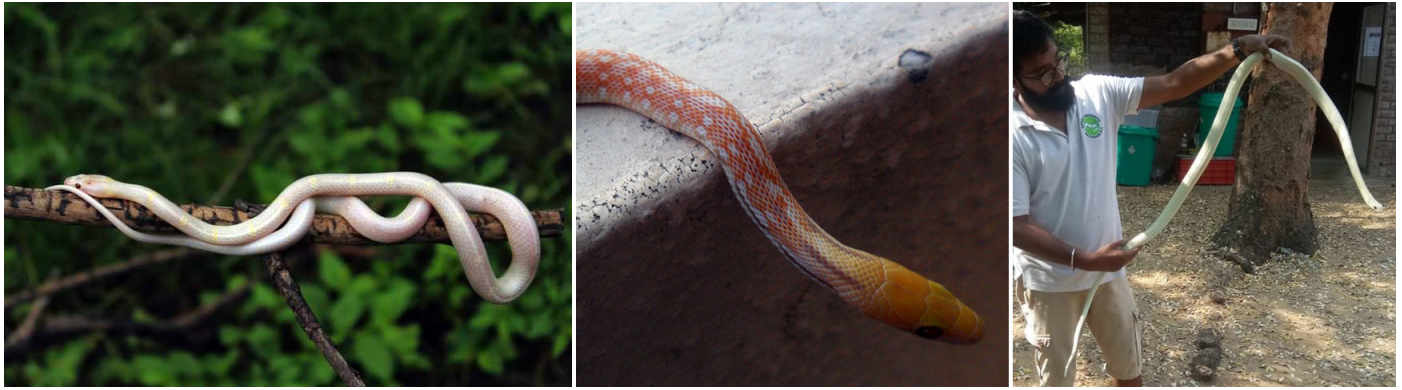
Fig. 4. An albino Common Wolfsnake ( Lycodon aulicus) from Jambughoda, Vadodara, Gujarat (left), Common Trinket Snake ( Coelognathus helena) from Vaso Village, Gujarat (center), and Indian Ratsnake ( Ptyas mucosa) from Madurai, Tamil Nadu, India (right).