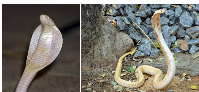
Fig. 3. Albino Spectacled Cobras ( Naja naja ) from Racharda Village, Ahmedabad, Gujarat (left), and Chengalpattu, Tamil Nadu, India (right).

Interestingly, diurnal species like Ptyas mucosa and Naja naja , had also survived to become healthy subadults or adults. We speculate that the overall low detectability of snakes enables survival in human-dominated landscapes despite abnormalities in pigmentation.