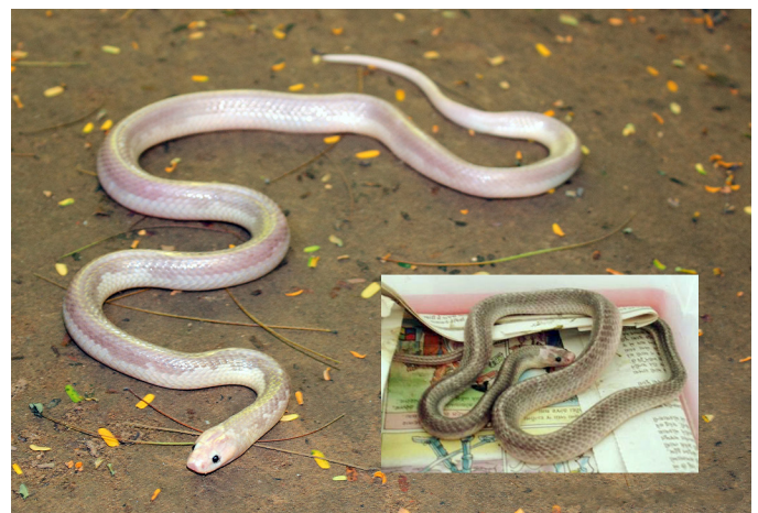
Fig. 1. Leucistic Common Kraits ( Bungarus caeruleus ) rescued on 23 April 2015 and 1 September 2007 (inset) in Vejalpur, Ahmedabad, Gujarat, India.

Color abnormalities, especially a lack of pigmentation, can be detrimental to the survival of animals (Caro 2005). However, seven of the 11 snakes recorded herein were adults or subadults and all were healthy. Nocturnal species, such as Bungarus caeruleus and Lycodon aulicus , probably survived until adulthood due to the elusive nature of nocturnal snakes that could reduce predatory pressure (Krecsák 2008).