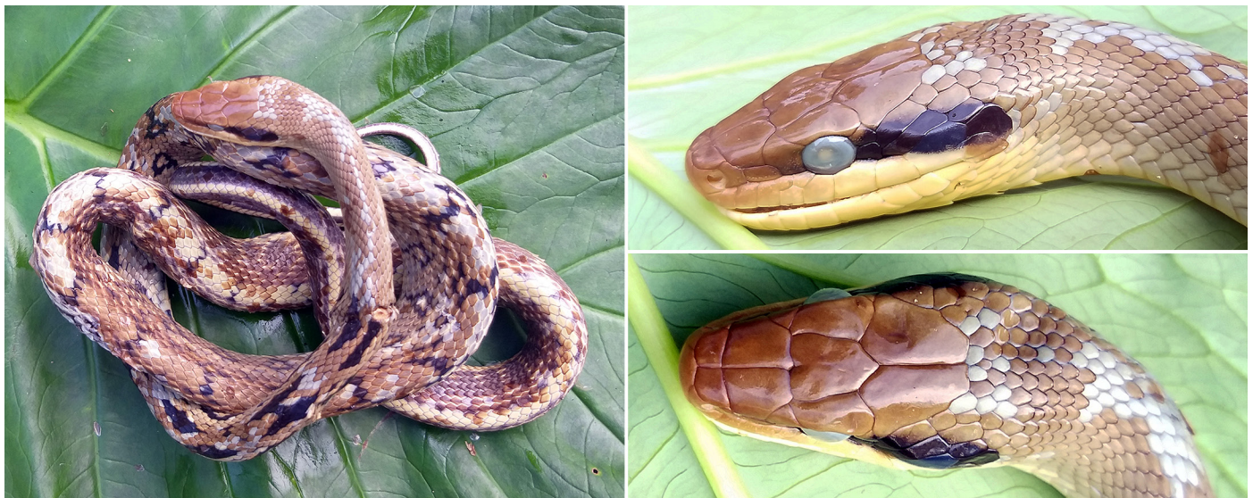
Fig. 2. Road-killed Beauty Snake ( Elaphe taeniura ) from the Itanagar Wildlife Sanctuary, Papumpare District, Arunachal Pradesh, India.