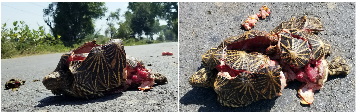
Fig. 1. A road-killed gravid female Indian Star Tortoise ( Geochelone elegans ) near Dantiwada, Banaskantha, Gujarat, India. Note the eggs in the background. Photographs by Mital Patel.

A considerable number of wild animals are recorded from agricultural fields, scrublands, and suburban fringes