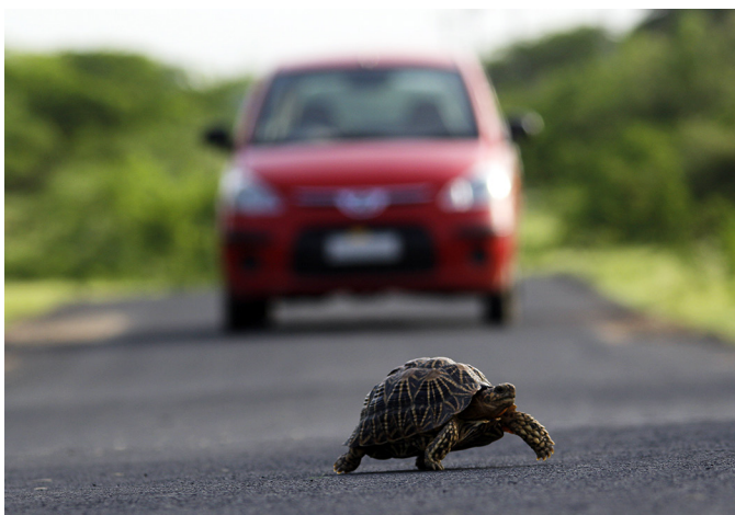
Fig. 4. A large female Indian Star Tortoise ( Geochelone elegans ) crossing the Modasar Road, Bhuj, Gujarat, India.

are noticeably fragmented, they often harbor Indian Star Tortoises, especially in Gujarat (Vyas 2006). Fragmentation is largely attributable to anthropogenic structures, including irrigation canals, railway tracks, and roads. Consequently, tortoises must cross such roads (Fig. 4) to fully exploit the fragmented habitats (Parasharya and Tere 2007).