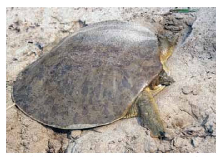
Fig 5. A female Apalone mutica excavating a nest along the White River, Arkansas.