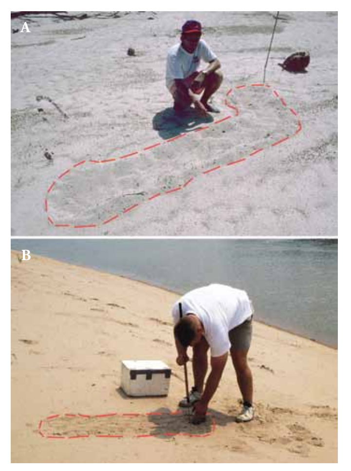
Fig. 3. (A) A curved trough (dashed outline) of Apalone spinifera on the Comite River in Louisiana. (B) A straight trough (dashed outline) of A. mutica on the White River in Arkansas. The researcher is probing to find the exact location of the nest.

tance away. We also have observed the process of trough excavation in one A. mutica .