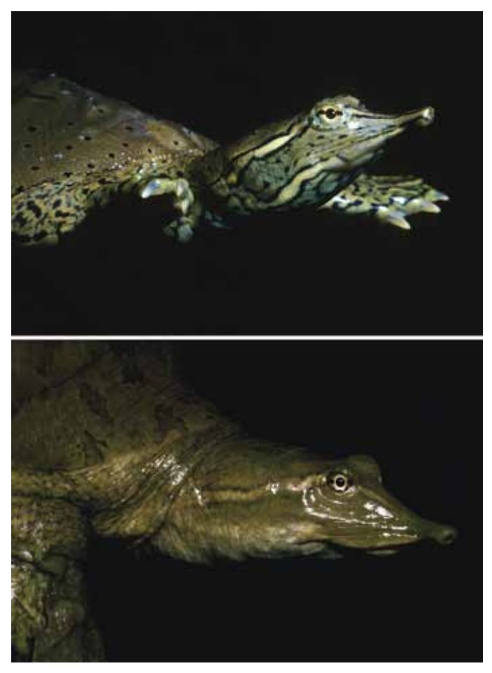
Fig. 1. Male Apalone spinifera (top) and male A. mutica (bottom).

Most nesting freshwater turtles minimize their time spent terrestrially, leaving the water to nest and returning immediately following nesting (Burke et al. 1994). Exceptions to this include some turtles that migrate long distances to nest (e.g., Emydoidea blandingi ; Rowe and Moll 1991) and species that bury themselves after nesting (e.g., Kinosternon flavescens and K. subrubrum ; Iverson 1990, Burke et al. 1994). Putative reasons for burrowing in Kinosternon include nest attendance/defense and awaiting conditions that would reduce stress or increase survival during the turtles' return to water (Iverson 1990, Burke et al. 1994).