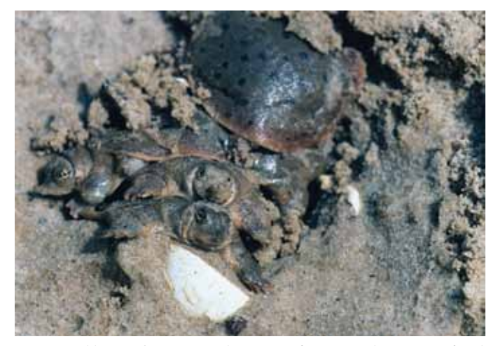
Fig. 6. Hatchling Apalone mutica ready to emerge from a nest (the top 5 cm of sand has been brushed back) along the Comite River, Louisiana.