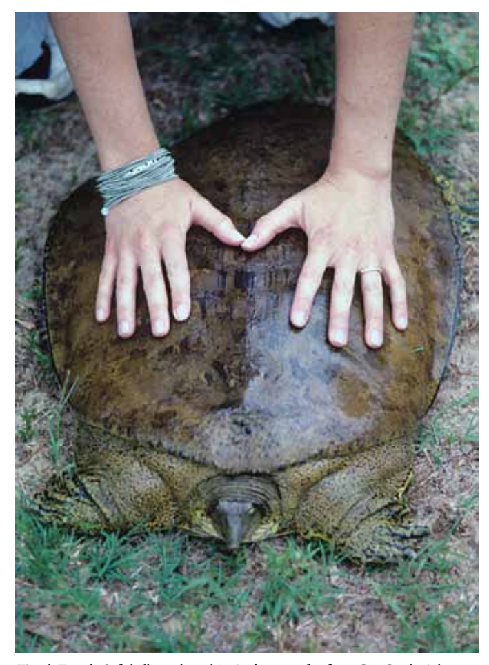
Fig. 4. Female Softshells, such as this Apalone spinifera from Gin Creek, Arkansas, can be quite large.

Another possible function is that nesting turtles bury themselves to more closely assess the suitability of substrate characteristics such as temperature. However, only 5% of 68 A. spinifera nests in one study were associated with the behavior (Doody 1995). Finally, mothers may simply respond to a physical constraint. Extended hot weather conditions or coarse-grained sand may render surface sand not cohesive, causing the sand to cave in on itself when a turtle attempts to excavate a chamber (Doody et al. 2004; Fig. 5) or when hatchlings try to emerge from the nest chamber (Mortimer 1990; Fig. 6). As a consequence, the closely related Pig-nosed Turtle ( Carettochelys insculpta ) may nest at lower elevations on sandbars due to the friable sand at higher elevations (Doody et al. 2004); however, lower elevations increase the risk of flood mortality. By burrowing, softshell