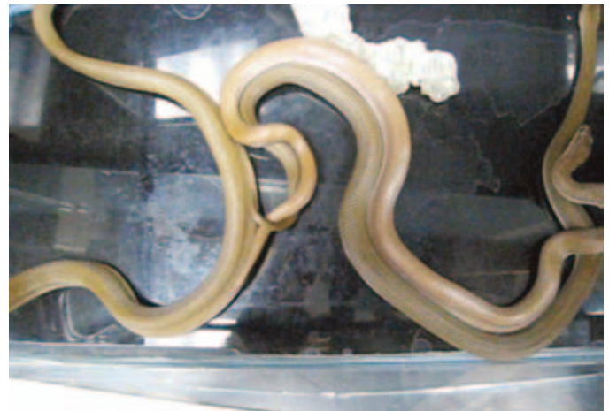
Male African Brown House Snake ( Lamprophis fuliginosus ) courting another male. Note that the bodies are parallel, the head of the courting male is along the dorso-lateral surface of the target male and Male 1 is performing a tail search of the target male. A freshly shed skin of the courted male is present.

(1951) described male-male courtship in captive Pituophis melanoleucus and postulated that this could have been due to the failure of chemical discrimination. Smith (1968) suggested that homosexual mating in snakes