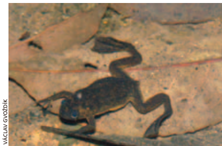
An enigmatic mortality event in the only known population of the critically endangered Lake Oku Clawed Frog ( Xenopus longipes ) is associated with an undiagnosed skin irritation.

Contemporary global declines and mortality events in amphibian populations have been often attributed to infectious disease and climate change, separately and in combination. BLACKBURN ET AL. (2010. African Journal of Herpetology 59:111–122) reported an enigmatic mortality event in the only known population of the critically endangered Lake Oku Clawed Frog ( Xenopus longipes ). This aquatic and biologically distinctive species is restricted to Lake Oku, a high-elevation crater lake on Mt. Oku in Cameroon. Neither a quantitative PCR-based screen nor histopathological analysis revealed the presence of the chytrid fungus ( Batrachochytrium dendrobatidis ), which is believed to be responsible for many declines and mortality events in amphibian populations around the world. Histopathology revealed widespread epidermal hyperplasia and multifocal saprolegniasis, suggesting that the animals have been exposed to a source of skin irritation. These sources might include acidified surface waters, perhaps derived from inorganic fertilizers or other human-related pollutants, or to local geological processes distinctive of the Cameroonian Volcanic Line. Currently, the causes underlying this mortality event remain obscure.