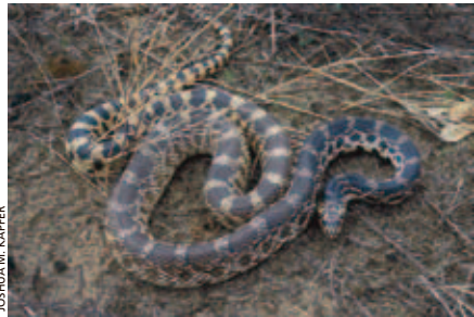
JOSHUA M. KAPFER

Effective wildlife conservation plans should consider both the habitat needs and spatial requirements of the species in question. Studies that focus on the correlation between the habitat preferences and movement patterns of wildlife, particularly snakes, are uncommon. KAPFER ET AL. (2010. Journal of Zoology 282:13–20) attempted to determine how habitat preferences or quality influenced movement patterns of snakes. To answer this question, the authors created a case model that incorporated habitat preference or avoidance information rigorously obtained for Bullsnares ( Pituophis catenifer sayi ) from 2003 to 2005 at a site in the upper mid-western US and compared it with minimum convex polygon estimates of home-range size. They employed geographical information systems to model the amount of preferred (open bluff faces) and avoided (agricultural fields and closed canopy forests) habitats within each estimated home range and compared them via multiple linear regression. They also tested the influence of gender, length, and weight on home-range size. Results indicated that home-