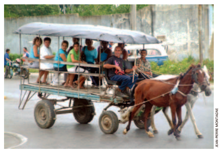
Horse-drawn carts are common, and often used for public transportation in this town on the way to the western coast.

small towns. Glued to the bus window, I reflected on the many differences compared to other countries I have visited. A huge difference is the lack of product advertising so pervasive in most global cultures. The only "bill-boards" I saw were artistic paintings depicting heroes of the Revolution and "advertising" governmental ideals and slogans. In some ways, rural Cuba seems very modern, with every house connected to an electrical wire, and yet we passed fields being plowed by oxen. Horse-driven carts were com-