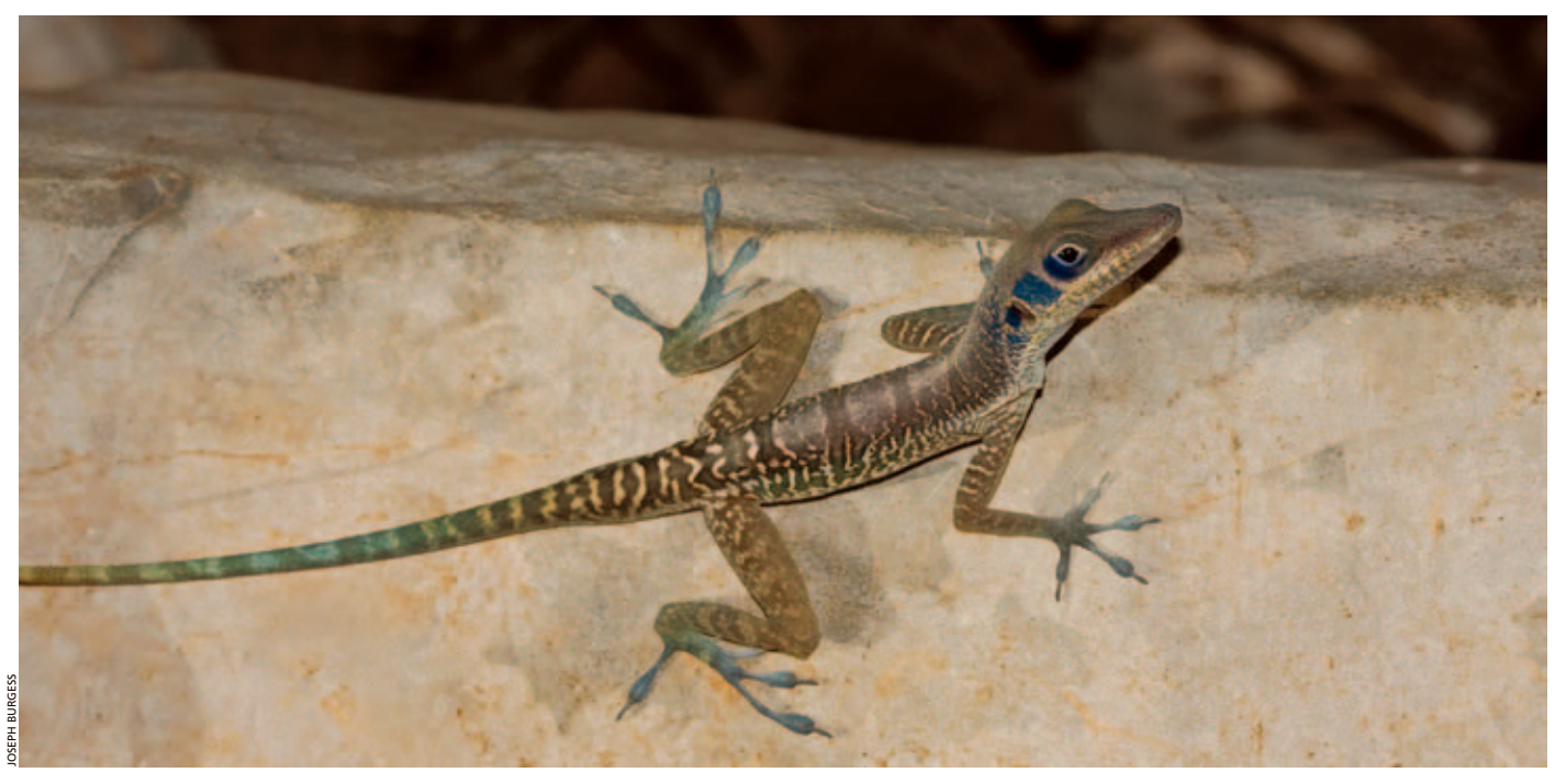
Pinar del Rio Cliff Anole (Anolis bartschi) in the Viñales Valley, Pinar del Río Province.