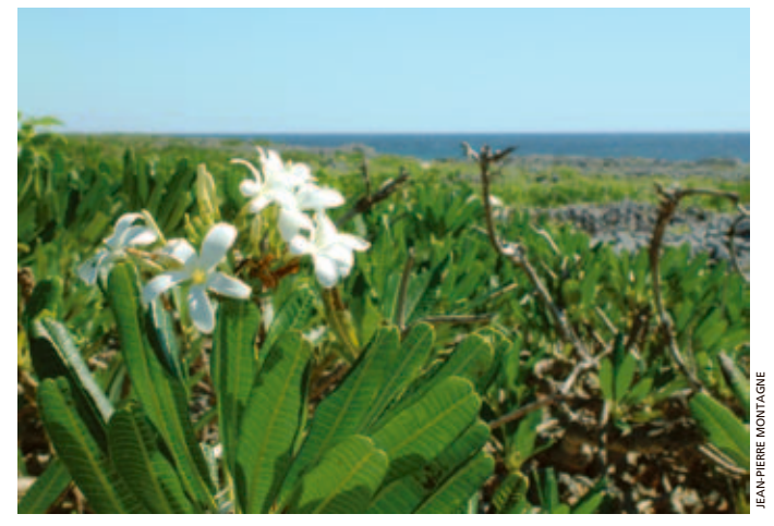
Blooming Plumeria found in the rocky limestone cliff habitat along the western coast of the Guanahacabibes Peninsula where iguanas were the most abundant.