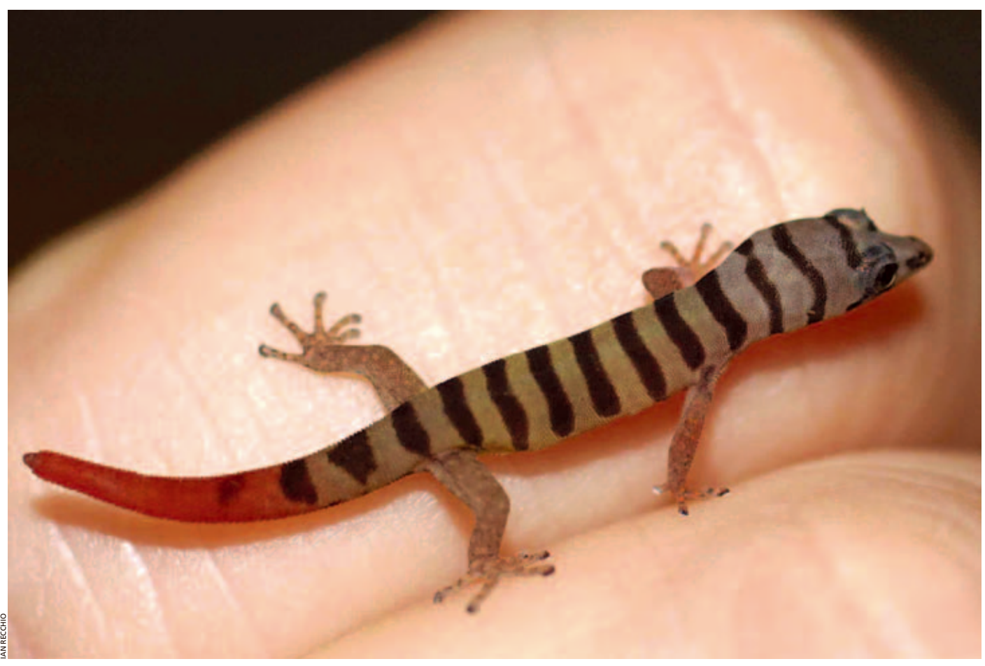
Ashy Sphaero (Sphaerodactylus elegans) on the Guanahacabibes Peninsula.

sive and objective database on biodiversity, and it plays a prominent role in guiding conservation activities for governments and scientists. In addition to the text that is viewable on the Red List website (www.iucnredlist.org), considerable data are recorded on each species' natural history, habitat, threats, and research and conservation actions. When the last assessment for Cyclura nubila was written, very little was known about its distribution, and most of that was inferred from our knowledge of the population at Guantánamo Bay. Being a data geek, I was thrilled to absorb the new information from the rest of the island. Having just been through the Mona Island Iguana assessment the previous night, I was very grateful for assis-