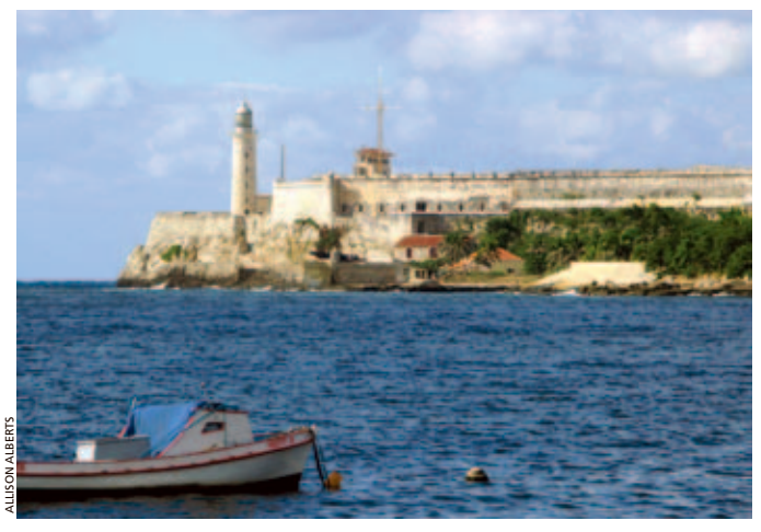
Castillo de los Tres Reyes del Morro, the fort and lighthouse at the entrance to the Havana harbor.

This time my trip included a little more time in Havana and a journey to the far western-most point for the meeting site. Travel restrictions for