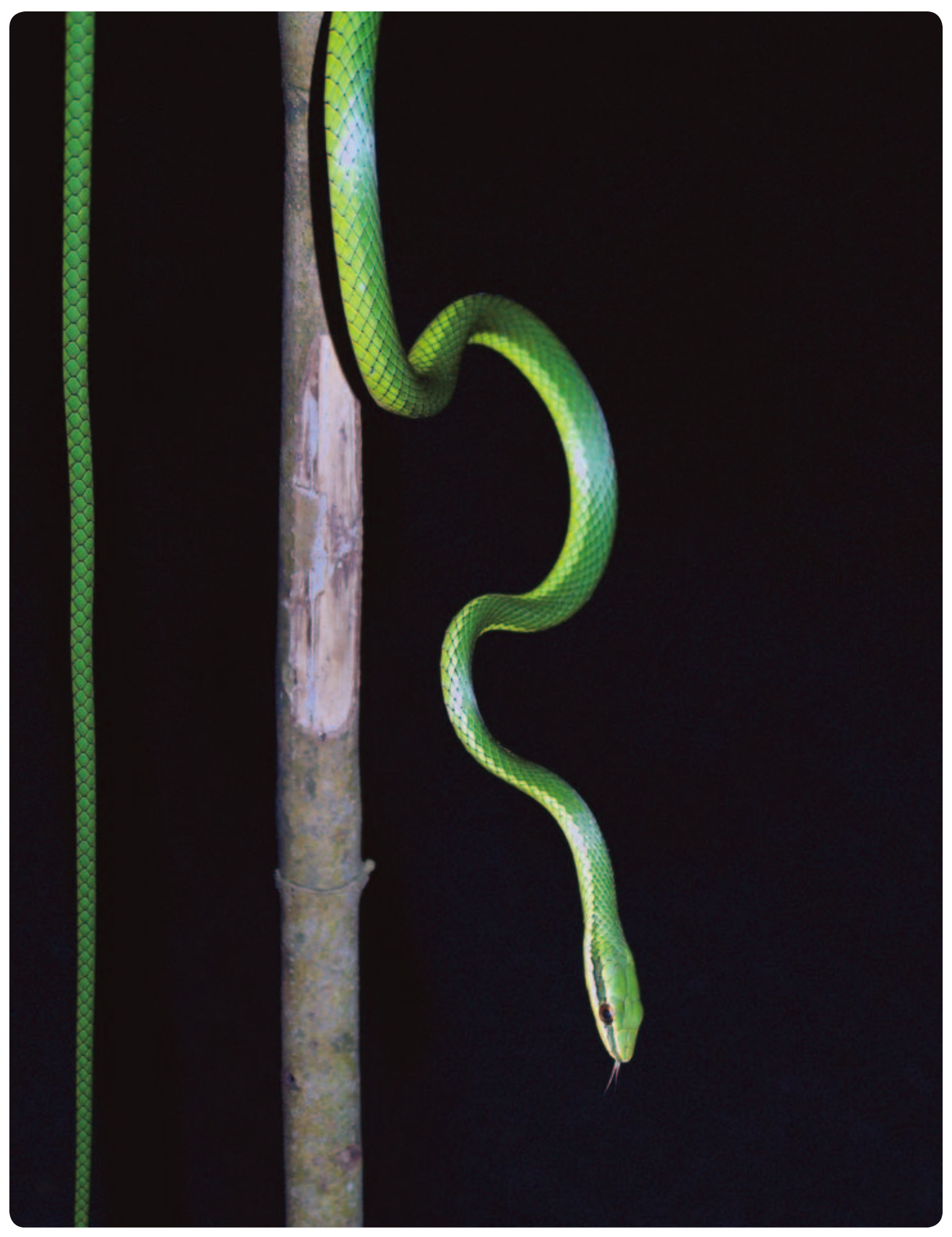
Blunt-headed Treesnakes (Uromacer catesbyt) are elegant anuran-killing machines. The other species in the genus (U. frenatus and U. oxyrhynchus) are lizard specialists.