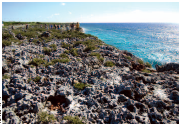
Field trip to the rocky limestone cliff habitat along the western coast of the Guanahacabibes Peninsula where iguanas were the most abundant.

with updates on iguana projects in the Greater and Lesser Antilles, Central America, Fiji, and Cuba. I was particularly interested in the eight talks presented by our Cuban colleagues, since so much had been accomplished toward monitoring and mapping the distribution and abundance of iguanas throughout Cuba — exactly what the PHVA group had determined was needed! A few studies also have been conducted on diet, morphological variation, reproduction, genetics, threats, and human use and attitudes. As is true for most Cuban herpetofauna, the biggest threat to iguanas is habitat alteration and fragmentation.