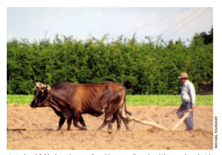
Agricultural fields along the route from Havana to Guanahacabibes are plowed with teams of oxen.

mon and appeared to serve as local buses. From my perspective of excessive abundance, Cuba is poor, but the poverty has a different face — no signs of malnutrition, and everyone has clean and well-kept clothes. Above all, absolutely no trash litters the roadsides or towns.