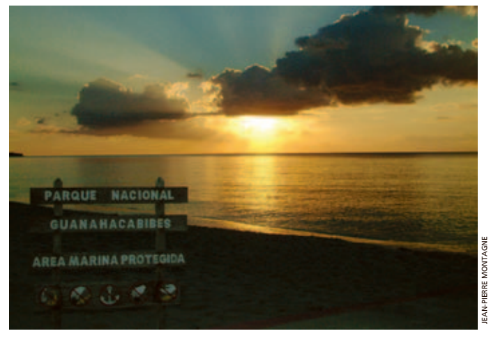
Sunset view at Maria la Gorda, a hotel specializing in scuba diving in the marine protected area of Parque Nacional, Guanahacabibes Peninsula.