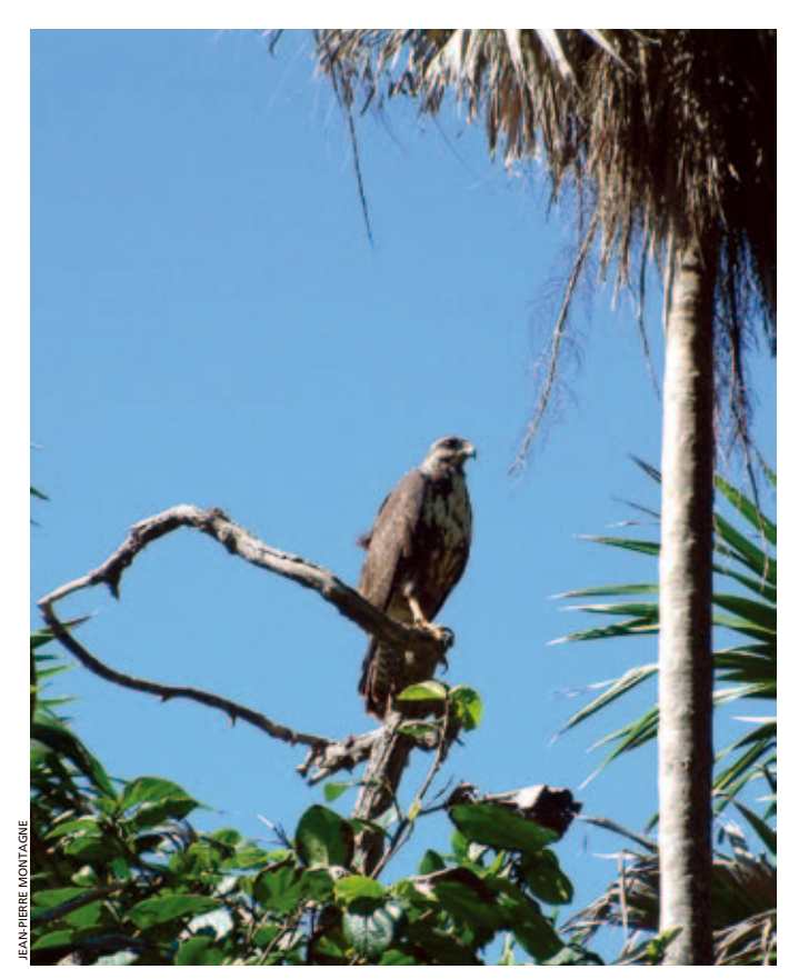
A juvenile endemic Cuban Black Hawk ( Buteogallus gundlachii ) on the Guanahacabibes Peninsula.