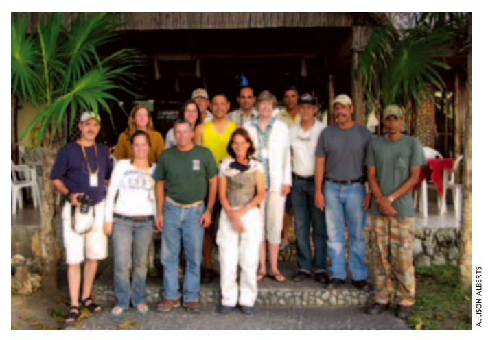
Sub-group workshop to revise the IUCN Red List assessment of the Cuban Iguana.

sive and objective database on biodiversity, and it plays a prominent role in guiding conservation activities for governments and scientists. In addition to the text that is viewable on the Red List website (www.iucnredlist.org), considerable data are recorded on each species' natural history, habitat, threats, and research and conservation actions. When the last assessment for Cyclura nubila was written, very little was known about its distribution, and most of that was inferred from our knowledge of the population at Guantánamo Bay. Being a data geek, I was thrilled to absorb the new information from the rest of the island. Having just been through the Mona Island Iguana assessment the previous night, I was very grateful for assis-