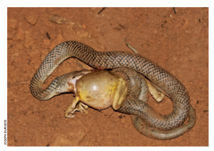
Cuban Racer (Cubophis cantherigerus) eating a Cuban Treefrog (Osteopilus septentrionalis), Guanahacabibes Peninsula.

On our last day at Guanahacabibes, I was delighted to have time to work with Cuban biologists to collect more information on current iguana research. One of my latest projects for the Iguana Specialist Group is to coordinate the creation or revision of Red List Assessments for all species in the family Iguanidae. The IUCN Red List is the world's most comprehen-