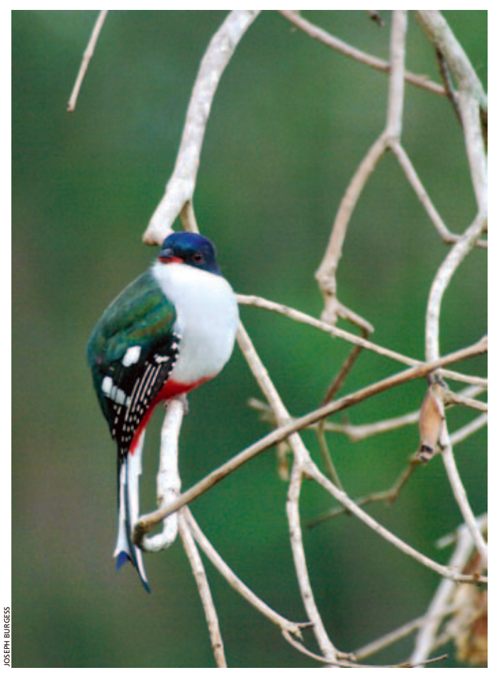
Cuban Trogon (Priotelus temnurus) on the Guanahacabibes Peninsula.

Toward the tip of the peninsula, we stopped at a depression where all the trees had died after Hurricane Ivan in 2004. This was an area that used to collect fresh water during seasonal rainfall, but the hurricane had substantially altered the land such that it now connects to the saline ocean and is toxic to those trees. At a nearby pond, we also had far-away views of an American Crocodile ( Crocodylus acutus ) and Cuban Slider ( Trachemys decussata ), which is the only freshwater turtle in Cuba. Thanks to Orlando and his field guide, we identified some great birds. These included the Red-legged Thrush ( Turdus plumbeus ), Black-throated Blue Warbler