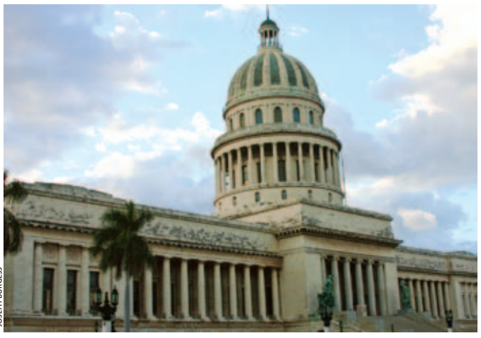
The seat of the government before The Revolución, the Capitolio Nacional Cuba on the edge of Habana Vieja, is now home to the Ministries of Science, Technology, and Environment.