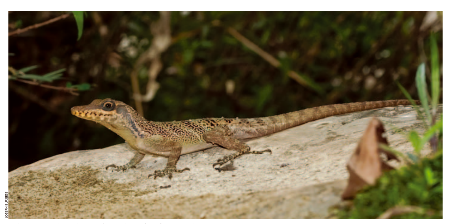
Cuban Stream Anole (Anolis vermiculatus) in the Viñales Valley, Pinar del Río Province.

us saw Anolis vermiculatus and A. bartschi , two amazing anoles endemic to this region.