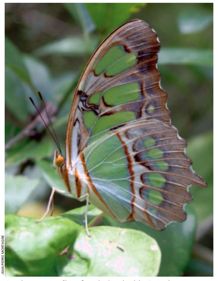
An unknown species of butterfly on the Guanahacabibes Peninsula.