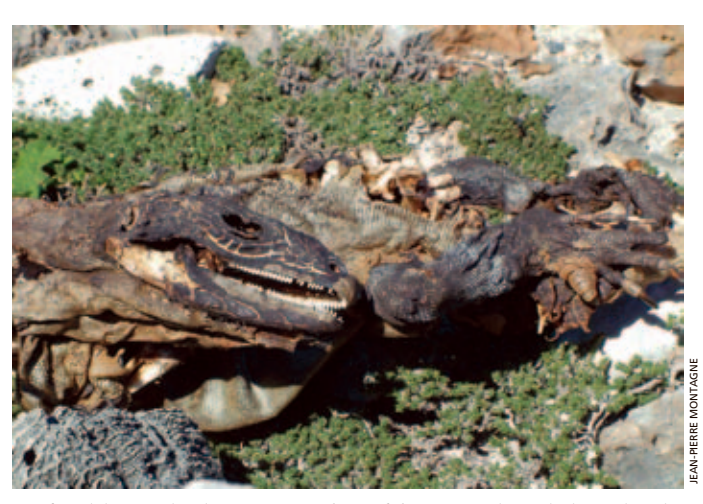
We found desiccated Cuban Iguana ( Cyclura nubila ) carcasses alongside the road on the Guanahacabibes Peninsula; their deaths were most likely attributable to automobiles.