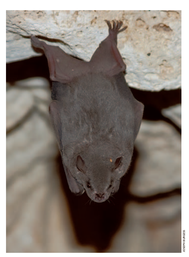
Cuban Fruit-eating Bat ( Brachyphylla nana ) in the Viñales Valley, Pinar del Río Province.

We took a slightly different route on the return trip back to Havana through the Viñales Valley. The little teaser of limestone hills we saw previously was small potatoes compared to the beauty of this national park! We stopped for a fabulous banquet lunch at an area where you could also tour part of the cave system by boat. Around the outsides of the caves, most of