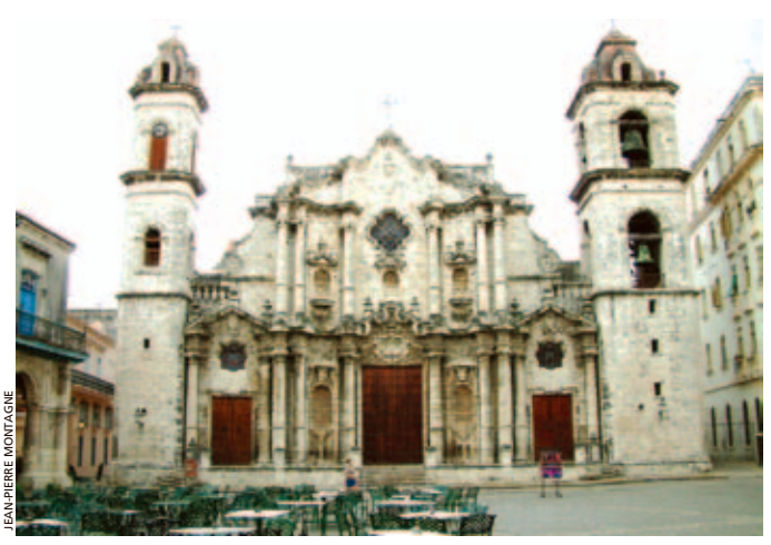
The Catholic cathedral in old Havana (Habana Vieja).