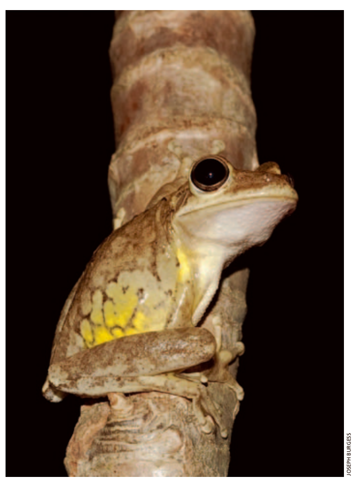
Cuban Treefrog (Osteopilus septentrionalis) on the Guanahacabibes Peninsula.

with updates on iguana projects in the Greater and Lesser Antilles, Central America, Fiji, and Cuba. I was particularly interested in the eight talks presented by our Cuban colleagues, since so much had been accomplished toward monitoring and mapping the distribution and abundance of iguanas throughout Cuba — exactly what the PHVA group had determined was needed! A few studies also have been conducted on diet, morphological variation, reproduction, genetics, threats, and human use and attitudes. As is true for most Cuban herpetofauna, the biggest threat to iguanas is habitat alteration and fragmentation.