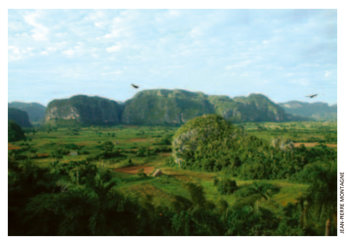
Limestone cliff/hills (mogotes) characterize the landscape of the Viñales Valley in north-central Pinar del Rio Province. Turkey Vultures ( Cathartes aura ) are visible in the foreground.

tance from Miguel Garcia and Cielo Figuerola, who served as interpreters during the evaluation for C. nubila .