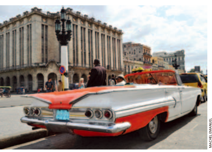
1960 Chevrolet Impala in Habana Vieja.