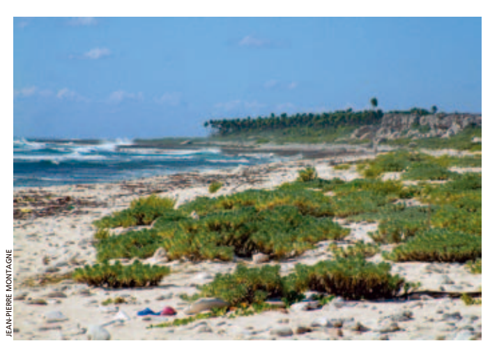
The rocky coastline at the western-most point of Cuba, the Guanahacabibes Peninsula. Even remote areas are not immune to flotsam trash washed ashore.

development of tourism. We learned that iguana density in this zone had been reduced from 17.2 to 4.0 iguanas/ha during construction of the road. Guanahacabibes park staff is working on an educational program for tourists and local residents to reduce the incidence of vehicular casualties.