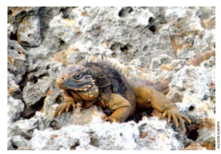
Male Cuban Iguana ( Cyclura nubila ) on the open rocky coast of the northwestern Guanahacabibes Peninsula.

development of tourism. We learned that iguana density in this zone had been reduced from 17.2 to 4.0 iguanas/ha during construction of the road. Guanahacabibes park staff is working on an educational program for tourists and local residents to reduce the incidence of vehicular casualties.