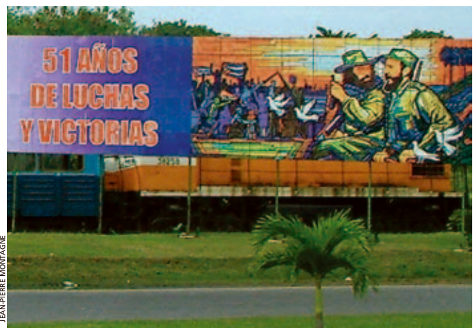
The only billboards in Cuba depict heroes and governmental ideals. "51 years of struggles and victories" refers to the time elapsed since the Cuban Revolution, and features Ernesto "Che" Guevara and Fidel Castro.

small towns. Glued to the bus window, I reflected on the many differences compared to other countries I have visited. A huge difference is the lack of product advertising so pervasive in most global cultures. The only "bill-boards" I saw were artistic paintings depicting heroes of the Revolution and "advertising" governmental ideals and slogans. In some ways, rural Cuba seems very modern, with every house connected to an electrical wire, and yet we passed fields being plowed by oxen. Horse-driven carts were com-