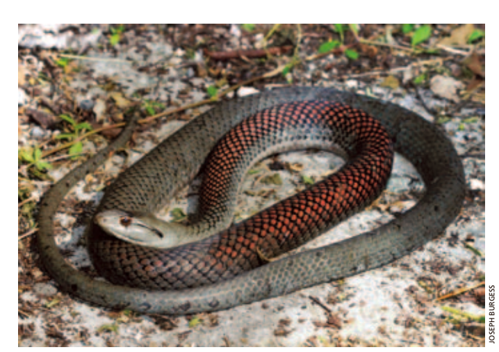
Cuban Racer (Cubophis cantherigerus) on the Guanahacabibes Peninsula.

Cuban Groin-spot Frog ( Eleutherodactylus atkinsi ) Guanahacabibes Frog ( Eleutherodactylus guanahacabibes ) Cuban Treefrog ( Osteopilus septentrionalis ) Western Giant Toad ( Peltophryne fustiger )