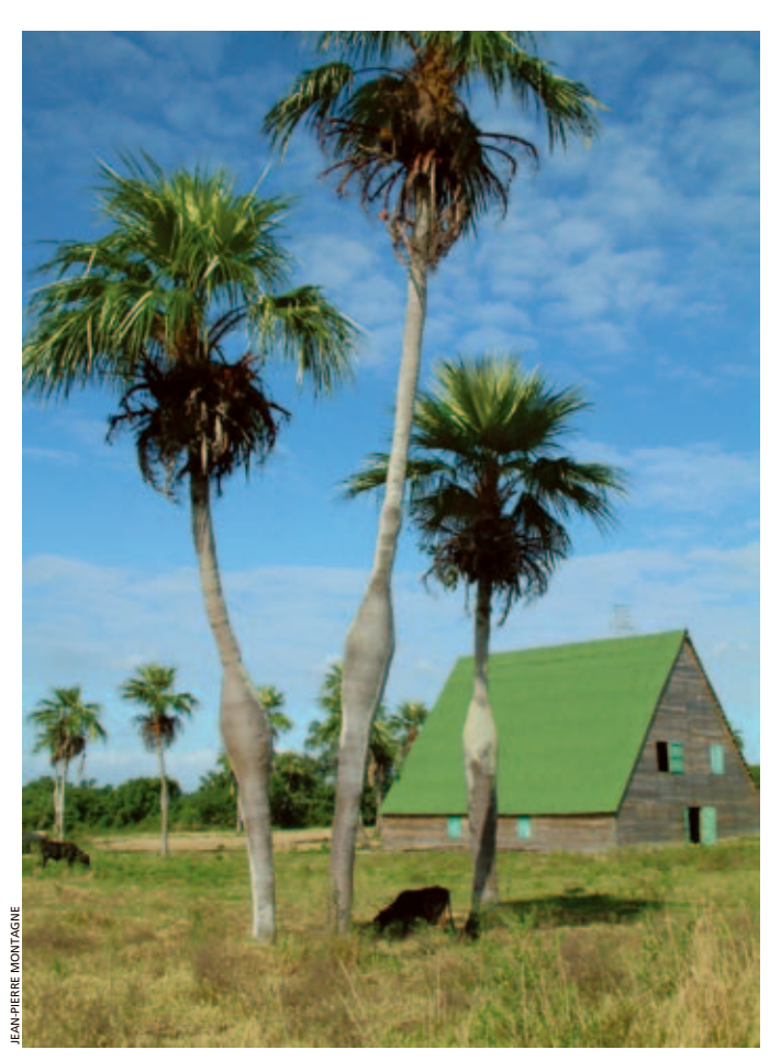
"Pregnant palms" at our first roadside rest stop on the way from Havana to the northwestern coast. Many species of palms in Cuba are harvested for wood and thatch.