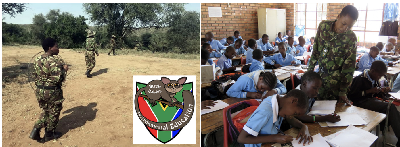
Fig. 21. Black Mamba patrols search for and remove snares (left) and interact with the community, here at a local school (right). Inset: Logo of the community outreach program.

relying instead on skill, training, and guts. In the process, they develop skills that help raise the status of women in the community and earn a salary that helps support their families. Just as important as patrolling, however, the Mambas also emphasize community outreach and social integration as a preventative measure. As part of their education mission they reach out to children through the Bush Babies program (Fig. 21), established in 2015 and engaging thousands of children in and out of school. Their goal is to reduce poaching by changing hearts and minds. As the covid pandemic hits conservation efforts and the tourism-based economy (Panchia 2021), the Black Mambas even assist in alleviating poverty, usually not a traditional role for conservation organizations. In many ways, the program is an exciting and novel model for such efforts — and one that works well.