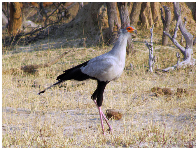
Fig. 18. A Secretary Bird ( Sagittarius serpentarius ) struts in its search for snakes.