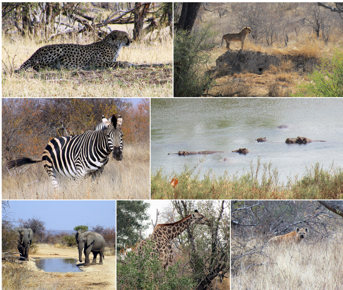
Fig. 19. Large mammals frequently encountered in the region include the Cheetah ( Acinonyx jubatus ), African Lion ( Panthera leo ), Plains Zebra ( Equus quagga ), Hippopotamus ( Hippopotamus amphibius ), African Bush Elephant ( Loxodonta africana ), South African Giraffe ( Giraffa camelopardalis ), and Spotted Hyena ( Crocuta crocuta ).

essential activity, and for some of the poorest, it still offers a main source of protein. As human populations grow and natural areas shrink, this kind of consumption, often illegal, is increasingly harmful, although even the most adamant conservationist can hardly blame a parent for trying to provide food for their family. However, the bigger problem is much less well-intended. Whoever the individual pulling the trigger might be, the illegal wildlife trade has become part of a multi-national, trans-boundary, multi-faceted crime empire. In the words of Meredith Gore and her colleagues (2019), it “has become the largest financial driver of social conflict, with severe implications for peace and security.” A bit simplistically, the same transportation networks that move rhino horns and elephant tusks around the world also are used for illegal drugs and other cross-border smuggling, and the same