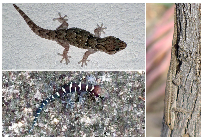
Fig. 13. Some geckos of the region, such as this Turner's Thick-toed Gecko ( Chondrodactylus turneri ) (top left), often reside in human habitations. Others, such as this Tiger Gecko ( Pachydactylus tigrinus ) photographed in southern Zimbabwe, are crevice dwellers in outcrops (lower left). Yet others, such as the widely distributed Cape Dwarf Geckos ( Lygodactylus capensis ) (right), are diurnal.