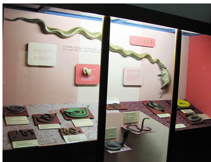
Fig. 14. Part of the Donald Broadley Gallery in the Natural History Museum of Zimbabwe, this display case shows some of the snakes found in the region.