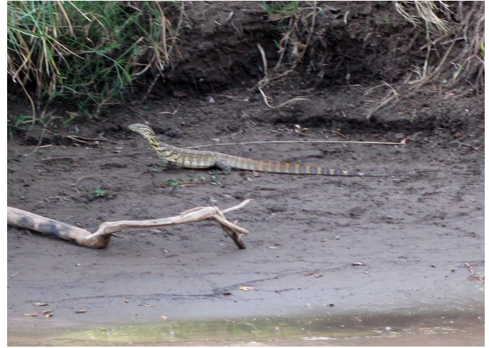
Fig. 7. A Nile Monitor ( Varanus niloticus ) sunning itself on the banks of a stream in the Limpopo area. Monitors can grow large and be aggressive and, despite their abundance in the pet trade, make poor pets.

mas (Agamidae), and cordylids (Cordylidae). Nile Monitors ( Varanus niloticus ) (Fig. 7) are most frequently encountered near