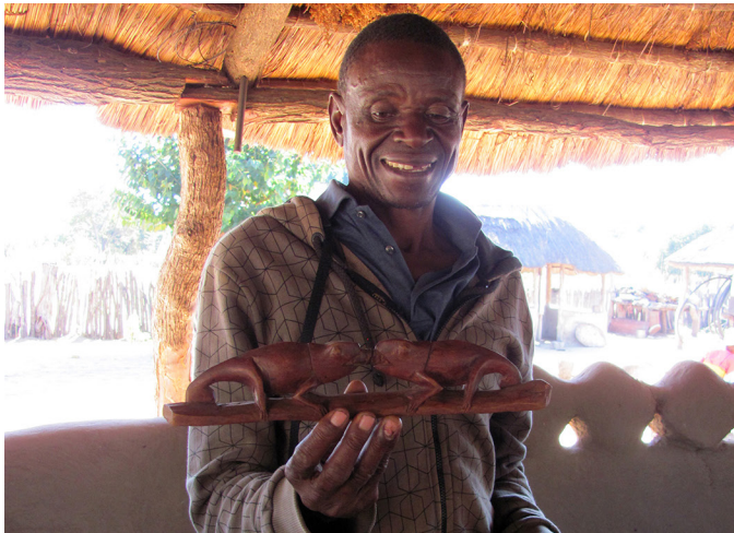
Fig. 8. An artisan at a local market offering for sale his wooden carving of dueling chameleons.