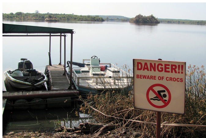
Fig. 3. A lake in Limpopo Province. The warning about crocodiles should be heeded in most bodies of water in the region.