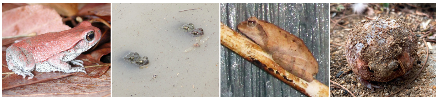
Fig. 16. The African Red Toad ( Schismaderma carens ) (left) often frequents dry savannah. Most amphibians in the region, including these toads ( Sclerophrys sp.) emerge to breed in temporary ponds (center left). A Grey Foam-nest Treefrog ( Chiromantis xerampelina ) takes advantage of the moist environment in a shower at the Balule Nature Reserve (center right). This Mozambique Rain Frog ( Breviceps mossambicus ) was defensively inflated when first discovered and was difficult to distinguish from a rock because of all the soil stuck to its skin (right).

Many other organisms occur in the area — too many to do them justice here. One plant that deserves attention, however, is the Baobab Tree ( Adansonia digitata ) (Fig. 17), which was immortalized in The Little Prince (Saint-Exupéry 1943). Unfortunately, climate change threatens its long-term survival. The unusual-looking Secretary Bird ( Sagittarius serpen-