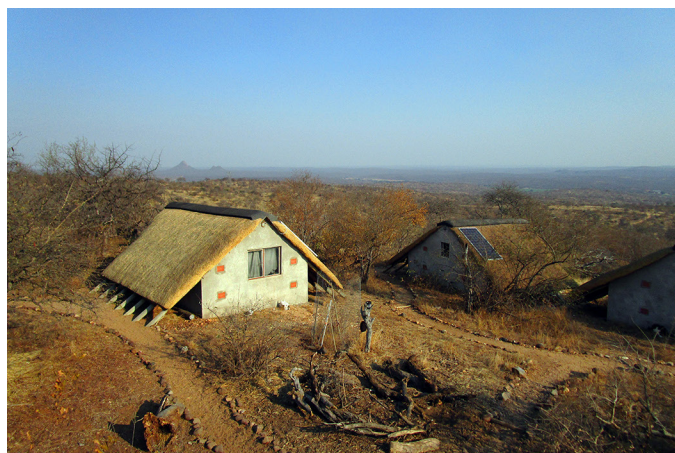
Fig. 2. Some of the chalets at the Indlovu Field Camp in the Balule Nature Reserve in South Africa. Solar panels ensure environmentally friendly power.

A lot of other herps occur in the region, many of them in taxonomic groups not native to North America or much