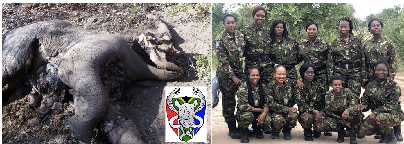
Fig. 20. Remains of a poached elephant (left) and the Black Mamba anti-poaching unit of the Balule Nature Reserve (right). Inset: Unit logo of the Black Mamba anti-poaching unit.

kingpins profit. Efforts to combat this trade also are multifaceted, and they enjoy bipartisan support in the U.S. Congress. Law-enforcement and non-governmental organizations are involved in the effort, as are academics and conservation professionals from around the world. As periodic news stories attest, these efforts have led to some successes — but the butchery of rhinos and other high-value species continues.