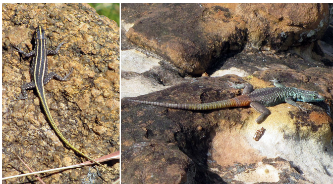
Fig. 10. Flat Lizards ( Platysaurus intermedius ) prefer rocky outcrops. The female (left) is much less colorful than the male (right).