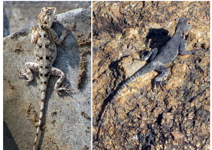
Fig. 9. Many agamas are highly tolerant of humans. This Ground Agama ( Agama aculeata ) (left) was perched on roofing materials. Rock escarpments offer a more natural setting for a female Blue-throated Agama ( Acanthocercus atricollis ) (right).