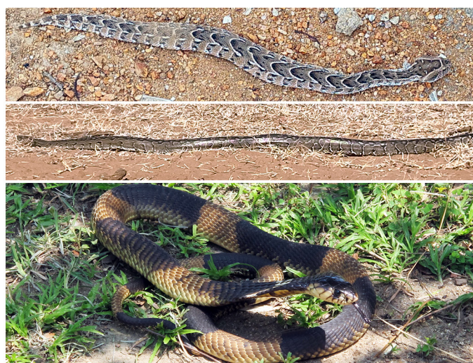
Fig. 15. Puff Adders ( Bitis arietans ) (top) are responsible for many bites in Africa because they are so well camouflaged in the scrub where they usually occur. An African Rock Python ( Python sebae ) (center) in scrubby habitat near a river bank in the Balule Nature Reserve. Snouted Cobras ( Naja annulifera ) (bottom) may exceed 2 m in length.