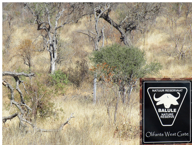
Fig. 1. Typical habitat in the Balule Nature Reserve in South Africa. Inset: Reserve logo displayed on one of the entrance gates.

The Balule Nature Reserve (Fig. 1) is located near a convenient airport in Hoedspruit, close to the boundary between Limpopo and Mpumalanga Provinces. This is a private reserve that houses a number of lodges, as well as the conservation-oriented Transfrontier Africa, which conducts conservation management and research, supports education and community efforts, and operates several camps. We stayed at the bucolic Indlovu Field Camp (Fig. 2), which usually does not house tourists. The town offers services such as well-stocked supermarkets, restaurants, banking, and a laundromat. Just