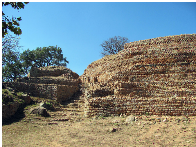
Fig. 4. Entrance to the Great Zimbabwe ruins just north of the border with South Africa.