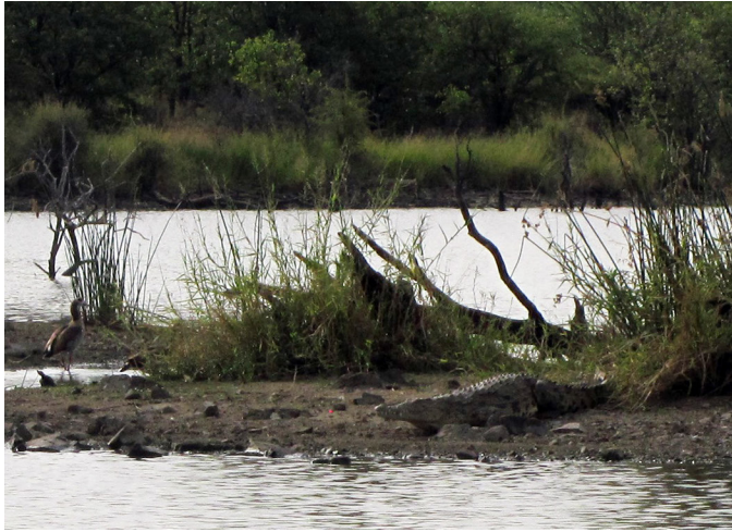
Fig. 6. A Nile Crocodile ( Crocodylus niloticus ) basking on a small island in a reservoir in the Limpopo area.

of Europe. Four notable lizard families in this category are the monitors (Varanidae), chameleons (Chamaeleonidae), aga-