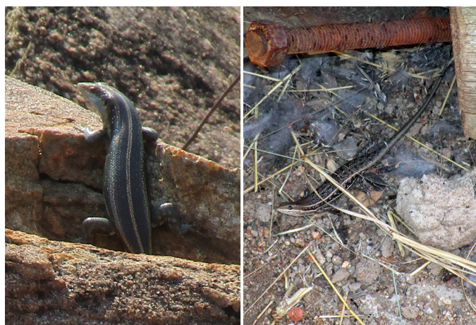
Fig. 12. Skinks are common in many African settings. Rainbow Skinks ( Trachylepis margaritifera ), such as this female (left) can be found in natural and human-associated settings. This Variable Skink ( T. varia ) (right) was in an abandoned pumphouse.

Another family, the lacertids (Lacertidae), do make it to Europe and look and behave very similar to the ground-dwelling racerunners and whiptails (Teiidae) familiar to many North Americans. Also familiar are the skinks (Scincidae) (Fig. 12),