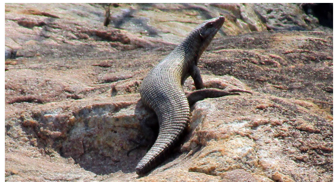
Fig. 11. Common Giant Plated Lizards ( Matobosaurus validus ), such as this stumpy-tailed individual from the Balule Nature Reserve, also favor rocky outcrops.