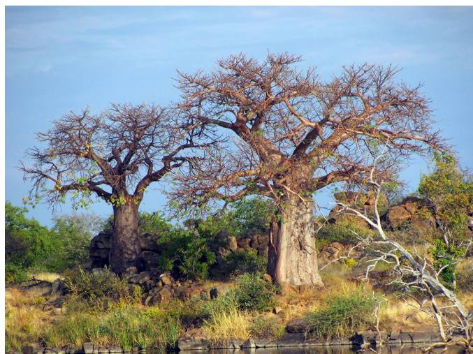
Fig. 17. The mighty Baobab ( Adansonia digitata ) has a remarkably thick trunk that stores water and facilitates survival during droughts.