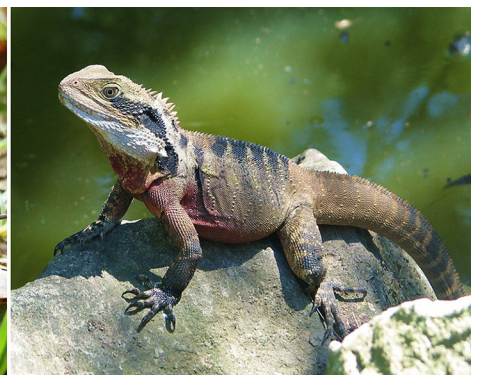
Fig. 5. Three agamid lizards: Eastern Bearded Dragon ( Pogona barbata ) (left), Jacky Dragon ( Amphibolurus muricatus ) (center), and Eastern Water Dragon ( Intellagama lesueurii lesueurii ) (right).