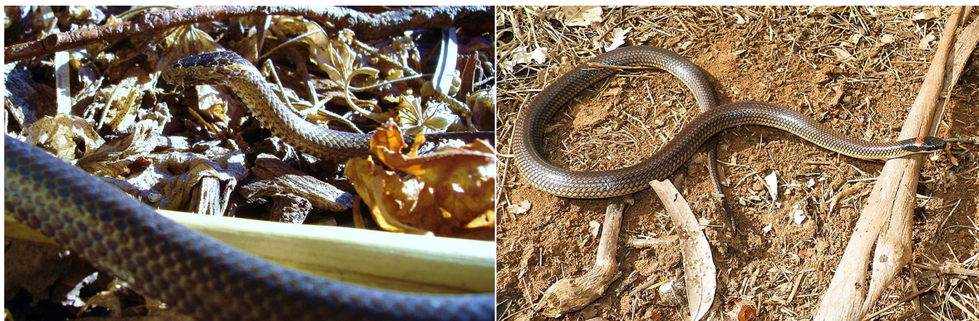
Fig. 13. Elapids recorded from single individuals: Golden-crowned Snake ( Cacophis squamulosus ) (left) and Red-naped Snake ( Furina diadema ) (right).