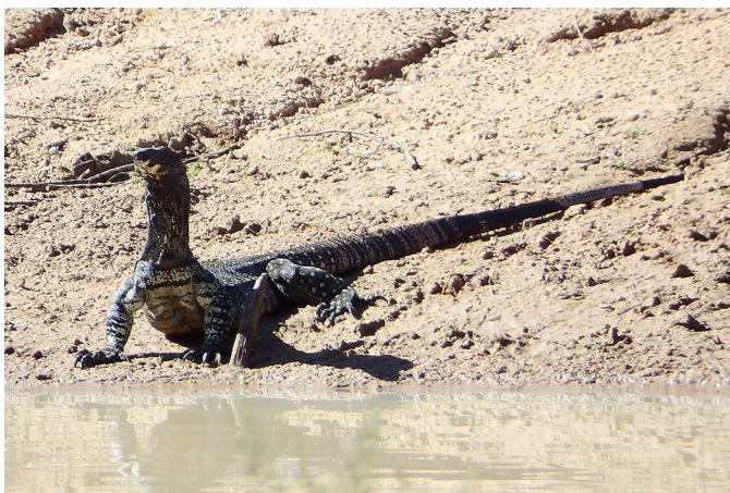
Fig. 10. An adult Lace Monitor ( Varanus varius ) at a farm dam.

Family Elapidae (elapids). —I recorded five species of elapids (Figs. 12–13), the most frequently observed of which was the Red-bellied Blacksnake ( Pseudechis porphyri-