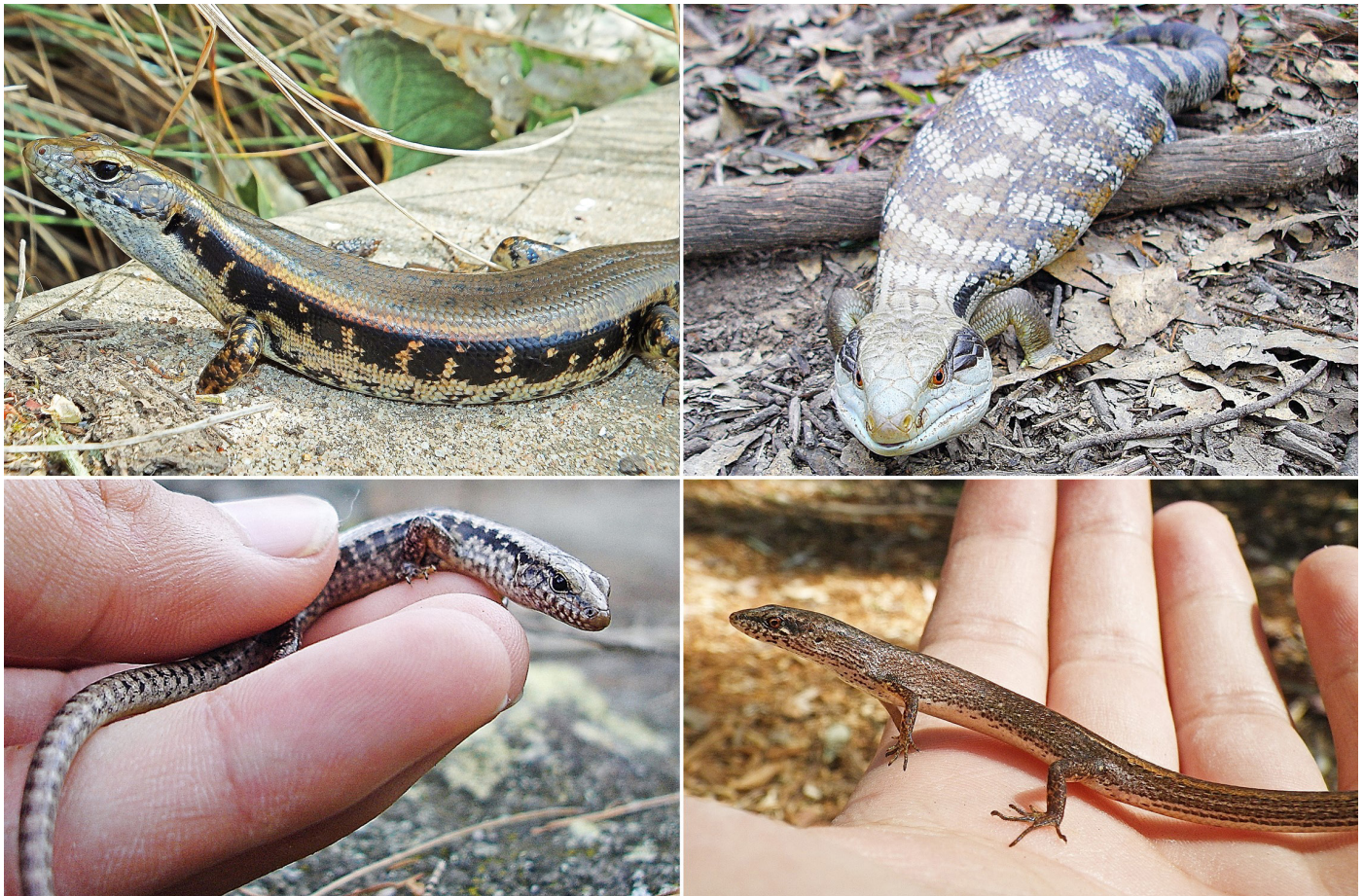
Fig. 8. Skinks widely distributed on the campus: Eastern Water Skink ( Eulamprus quoyii ) (top left), Eastern Blue-tongued Skink ( Tiliqua scincoides scincoides ) (top right), Greater Bar-sided Skink ( Concinnia tenuis ) (bottom left), and Weasel Skink ( Saproscincus mustelinus ) (bottom right).

were easily visible basking and foraging in exposed locations. The Greater Bar-sided Skink ( Concinnia tenuis ) and Weasel Skink ( Saproscincus mustelinus ) were more cryptic but also widespread. I recorded the former on the main campus and in the Yarramundi, Blacktown, Clarendon, and Rickaby Paddocks, usually on walls of buildings or in woody debris. I recorded the latter in the Yarramundi, Blacktown, Clarendon, and Rickaby Paddocks, always beneath surface debris. I observed a single Copper-tailed Skink ( Ctenotus taeniolatus ) retreating from a basking site on a woodland edge in the Yarramundi Paddocks. The Eastern Striped Skink ( C. robustus ) and Three-