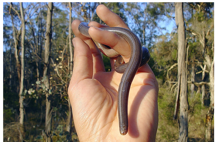
Fig. 11. A Blackish Blindsnake ( Anilius nigrescens ) in hand.