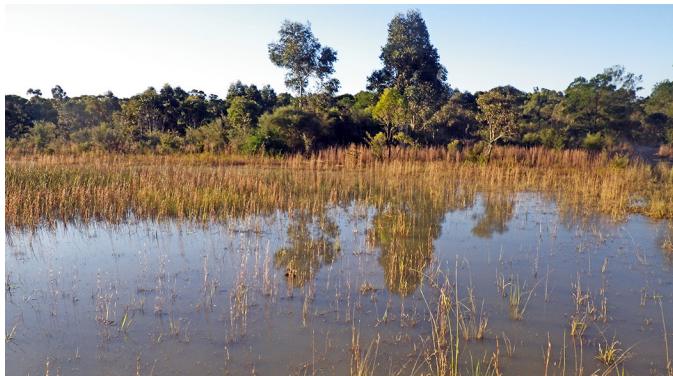
Fig. 2. Ephemeral wetlands and remnant woodlands in the Blacktown Paddocks on the Western Sydney University Hawkesbury Campus.

Family Chelidae (freshwater turtles). —I recorded two species of freshwater turtles (Fig. 4). The Eastern Snake-necked