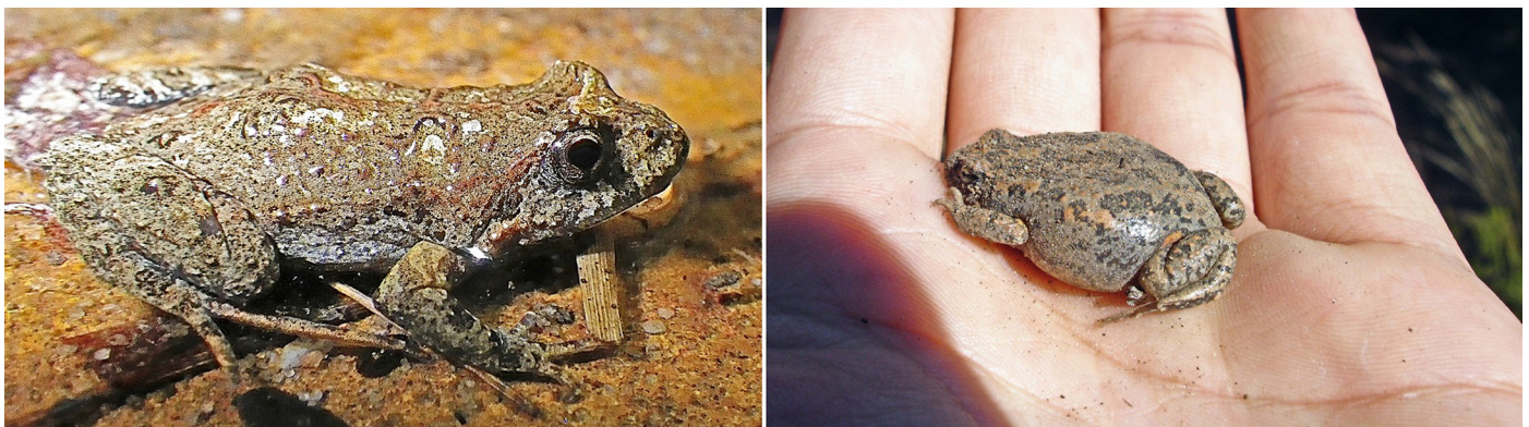
Fig. 18. Australian waterfrogs: Common Eastern Froglet ( Crinia signifera ) (left) and Smooth Toadlet ( Uperoleia laevigata ) (right).

was notably absent at farm dams, despite occurring prolifically in other locations where bodies of water are limited to non-flowing ponds (Piza-Roca et al. 2018). Consequently, this isolated population could easily be missed during cursory surveys. This might also be the case for the Macquarie Turtle, although one or more individuals might have been released from other locations subsequent to the 2004 report. These turtles have been readily observed at other frequently