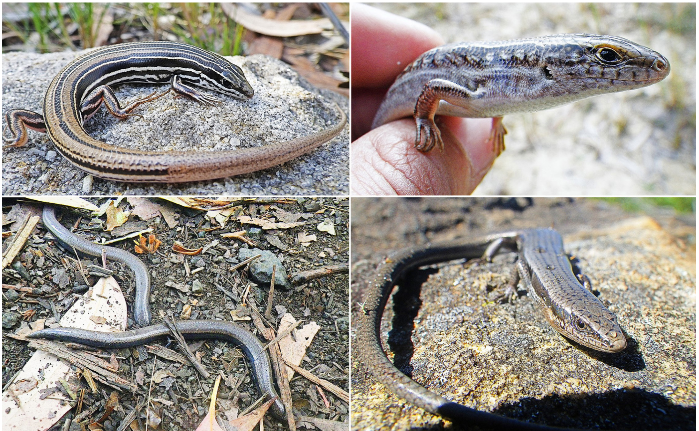
Fig. 9. Skinks recorded from few individuals: Copper-tailed Skink ( Ctenotus taeniolatus ) (top left), Eastern Striped Skink ( Ctenotus robustus ) (top right), Three-toed Skink ( Saiphos equalis ) (bottom left), and Red-throated Skink ( Acritoscincus platynotus ) (bottom right).

observed only adults (Fig. 10) in the Yarramundi, Blacktown, Clarendon, and Rickaby Paddocks.