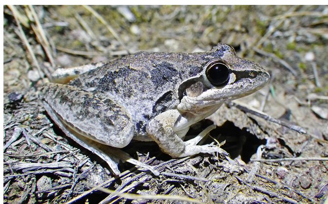
Fig. 15. One of four Broad-palmed Rocket Frogs ( Litoria latopalmata ) found during spotlighting.