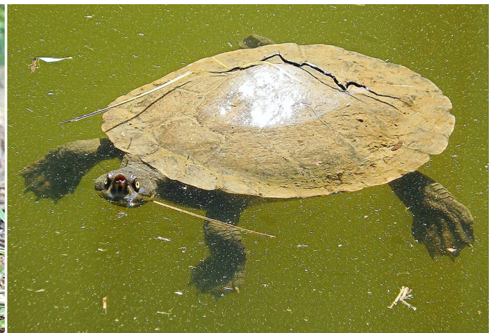
Fig. 4. Freshwater turtles: Eastern Snake-necked Turtle ( Chelodina longicollis ) (left) and Macquarie Turtle ( Emydura macquarii ) (right).