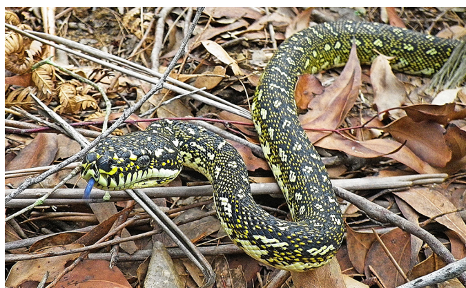
Fig. 14. A Diamond Python ( Morelia spilota spilota ) removed from a farm building.