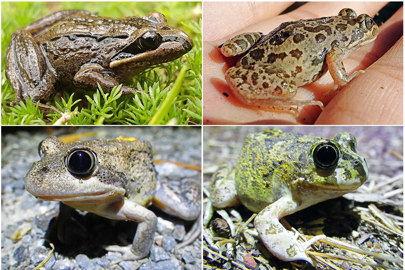
Fig. 17. Australian groundfrogs: Striped Marsh Frog ( Limnodynastes peronii ) (top left), Spotted Grassfrog ( Limnodynastes tasmaniensis ) (top right), Eastern Banjo Frog ( Limnodynastes dumerilii ) (bottom left), and Ornate Burrowing Frog ( Platyplectrum ornatum ) (bottom right).