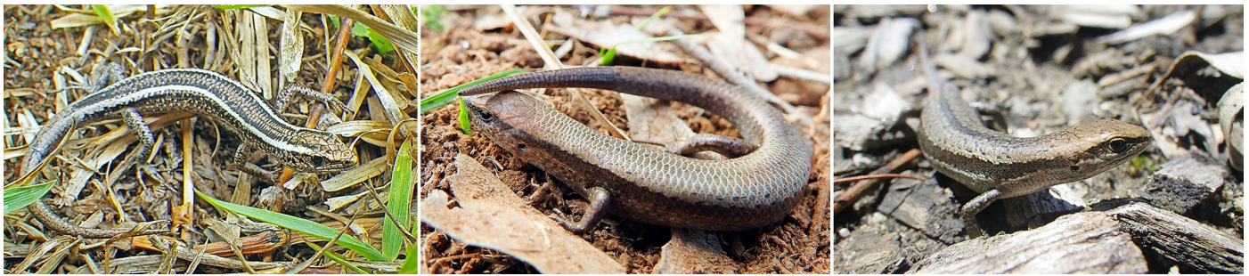
Fig. 7. Small skinks that thrive in developed areas: Elegant Snake-eyed Skink ( Cryptoblepharus pulcher pulcher ) (left), Dark-flecked Garden Sunskink ( Lampropholis delicata ) (center), and Pale-flecked Garden Sunskink ( Lampropholis guichenoti ) (right).