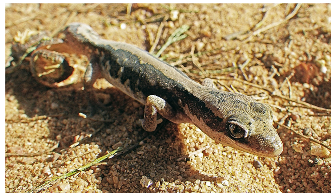
Fig. 6. A Wood Gecko ( Diplodactylus vittatus ) found beneath a fallen log.

Family Scincidae (skinks). —I recorded 11 species of skinks (Figs. 7–9). Five species (Elegant Snake-eyed Skink, Cryptoblepharus pulcher pulcher ; Dark-flecked Garden Sunskink, Lampropholis delicata ; Pale-flecked Garden Sunskink, L. guichenoti ; Eastern Water Skink, Eulamprus quoyii ; and Eastern Blue-tongued Skink, Tiliqua scincoides scincoides ) were found in all sections of the campus. These species