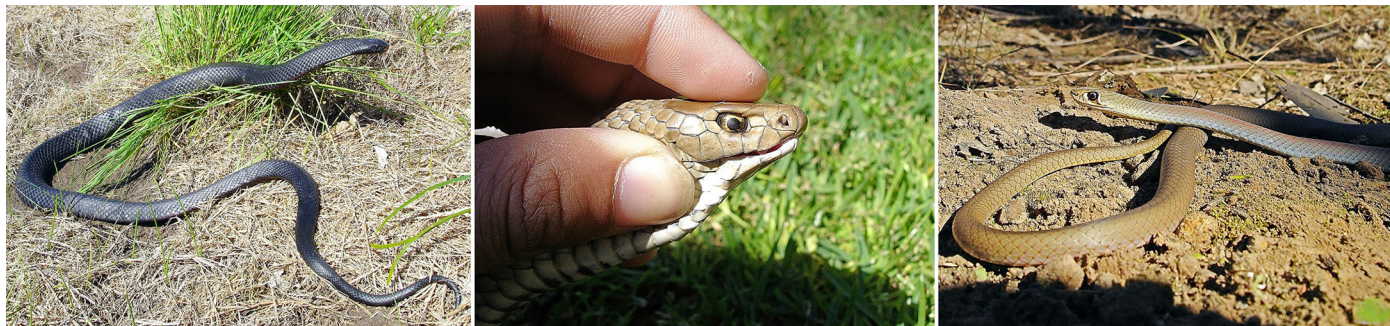
Fig. 12. Elapids recorded from multiple individuals: Red-bellied Blacksnake ( Pseudechis porphyriacus ) (left), Eastern Brownsnake ( Pseudonaja textilis ) (center), and Yellow-faced Whipsnake ( Demansia psammophis ) (right).

surface debris in woodland remnants in the Yarramundi, Blacktown, Clarendon, and Rickaby Paddocks. The Golden-crowned Snake ( Cacophis squamulosus ) and Red-naped Snake ( Furina diadema ), each observed only once, were predicted to occur at the study site by White and Burgin (2004). The Golden-crowned Snake was under a discarded tractor tire near a farm building in the Blacktown Paddocks, and the Red-naped Snake was under a piece of discarded corrugated iron in a woodland remnant in the Yarramundi Paddocks. White and Burgin (2004) also predicted that a sixth species