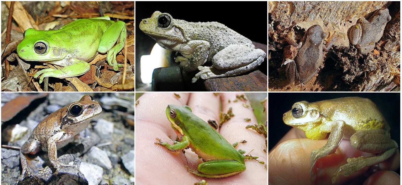
Fig. 16. Treefrogs recorded from multiple observations: Common Green Treefrog ( Ranoidea caerulea ) (top left), Peron's Treefrog ( Litoria peronii ) (top center), Screaming Treefrog ( Litoria quiritatus ) (top right), Verreaux's Treefrog ( Litoria verreauxii ) (bottom left), Eastern Dwarf Treefrog ( Litoria fallax ) (bottom center), and Tyler's Treefrog ( Litoria tylei ) (bottom right).