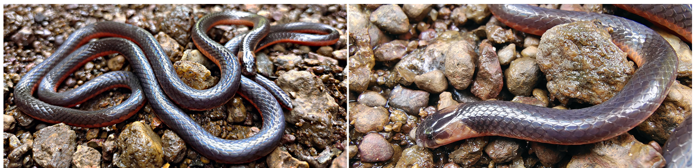
Fig. 1. A Castoe’s Coralsnake ( Calliophis castoe ) from Kasai, Dodamarg, Maharashtra, Maharashtra, India.

These three encounters with C. castoe in less than two weeks suggest that the species might be more common in the northern Western Ghats than the number of known records would indicate. Also, in addition to confirming the presence of the species in the Dodamarg region of southern Maharashtra, these new records bridge a gap in the known