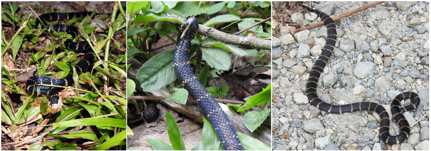
Fig. 2. Villavicencio Coralsnakes ( Micrurus medemi ) from Conucos (A), Chirajara Baja (B), and San Antonio (C), Guayabetal, Cundinamarca, Colombia.

These three individuals are new departmental records for Cundinamarca and the first snake extends the known elevational range for the species to 1,577 m asl.