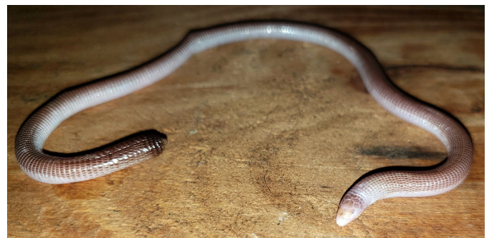
Fig. 1. A Robert’s Wormlizard ( Amphisbaena roberti ) (ZUFMS-REP 4524) collected after attempted predation by a Southern Lapwing ( Vanellus chilensis ) (Charadriidae).

Our search in Google Scholar resulted in 92 records, 10 with relevant geographic distribution data for Amphisbaena roberti (most records cited only the species name), and only one reporting predation by the mildly venomous semifossorial false coral snake, Phalotris lativittatus (Braz et al. 2014). The search of our personal files recovered 13 articles with informa-