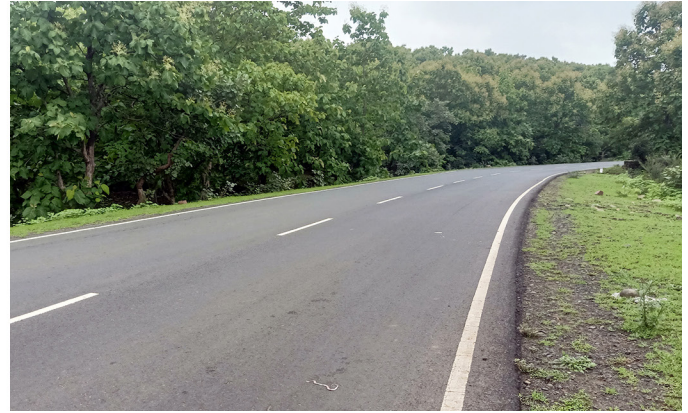
Fig. 3. Habitat where a road-killed Condanarus Sandsnake ( Psammophis condanarus ) was found at Bhamora Village, Bhopal, Madhya Pradesh, India.