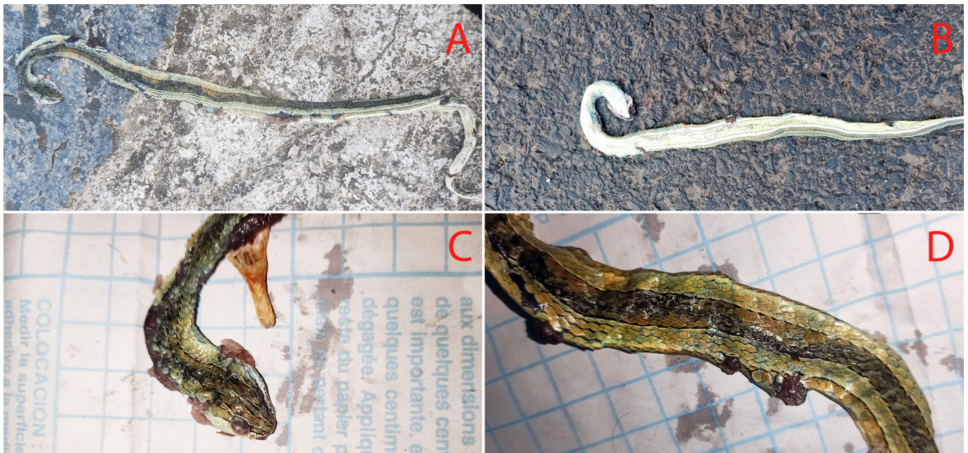
Fig. 1. A road-killed Condanarus Sandsnake ( Psammophis condanarus): Dorsal (A) and ventral (B) views of the body, dorsal view of the head (C), and the dorsum at midbody (D).