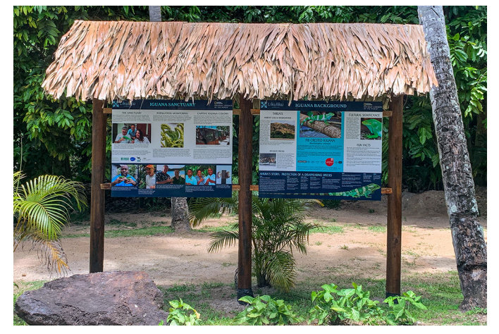
The guest Interpretive Centre at the Likuliku Lagoon Resort 2019.