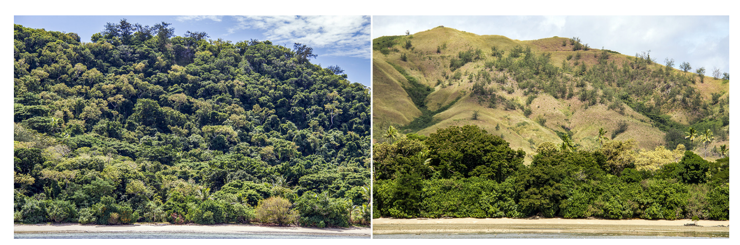
Pristine dry-forest cover on uninhabited islands compared to predominantly grassland coverage on islands with human settlements.

In March 2017, a 10 x 10 m grid at the Likuliku Lagoon Resort was planted with 20 saplings of the 12 most important tropical dry-forest species, all spaced according to a natural forest setting. This grid — to our knowledge the first of its kind in the world — served as an effective prototype for natural, self-propagating iguana habitat. Distribution was based on factors such as rate of growth and eventual height, trunk size, and canopy coverage. A second grid was planted in 2018.