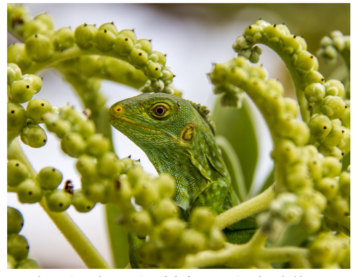
Juvenile Fiji Crested Iguana ( Brachylophus vitiensis ) at the Likuliku Lagoon Resort in 2015.

3 eggs at any one time (each egg is around 4 cm long and 2 cm wide) and they take nine months to incubate, the longest incubation period known for any iguana.