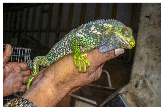
The injured Fiji Crested Iguana ( Brachylophus vitiensis ) found at the Likuliku Lagoon Resort on Mololo Levu Island in Fiji in 2010.