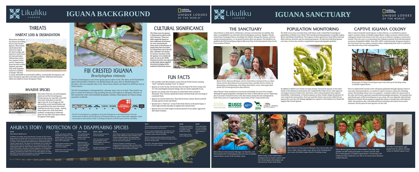
Interpretive signs about the Fiji Crested Iguana (Brachylophus vitiensis) at the Likuliku Lagoon Resort 2019.

grams to preserve and enlarge what remained of the natural dry-forest habitat and to reduce the number of non-native predators.