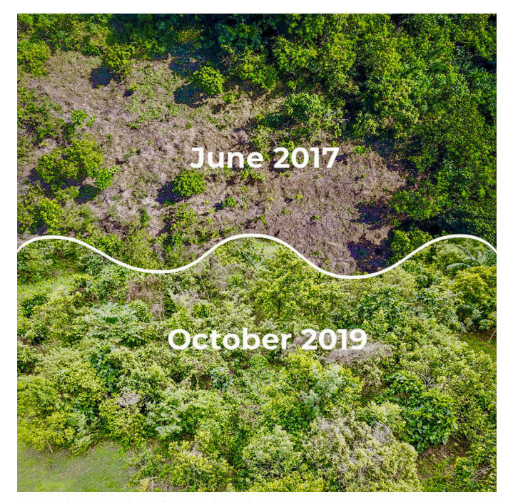
The before and after of successful reforestation.

While the restoration work continues, a marked change is already evident in the profile of vegetation in the leased areas,