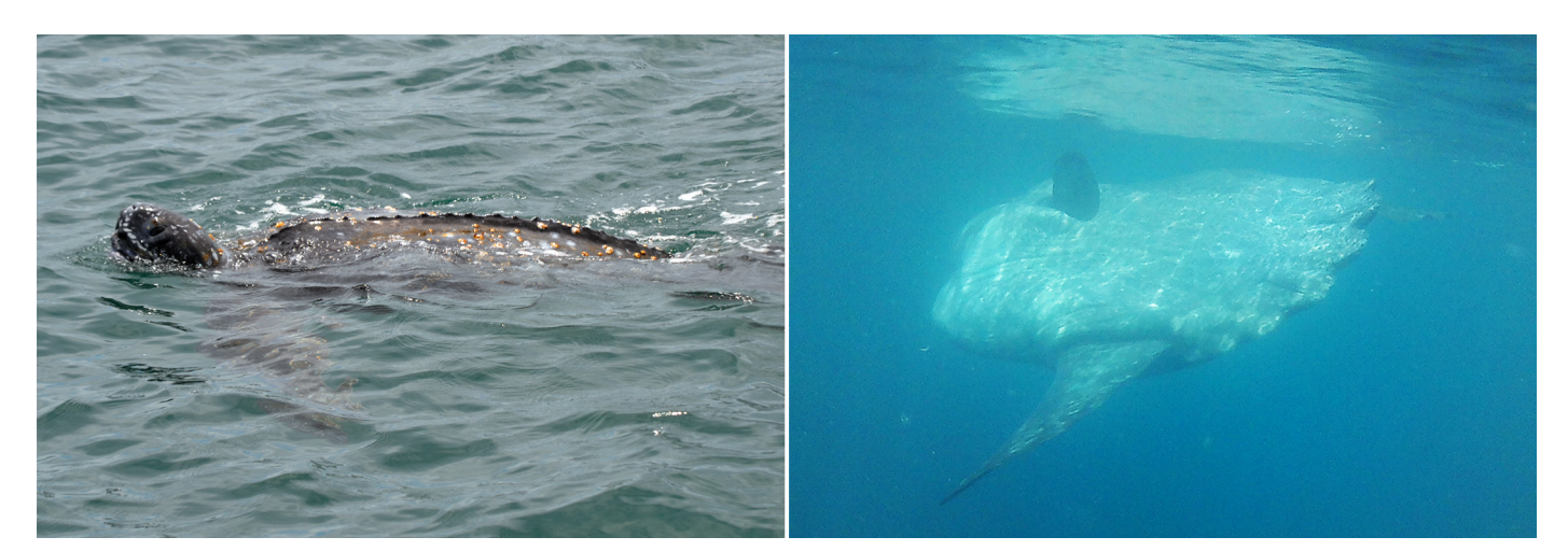
Figure 2. Leatherback Turtle ( Dermochelys coriacea ) (left) and Ocean Sunfish ( Mola mola ) (right) at Arraial do Cabo, Brazil.

The Leatherback Turtle is an oceanic species crossing ocean basins between Brazil and Africa (Almeida el al. 2011). Although evidence exists of Leatherbacks foraging in southwestern Atlantic coastal waters (López-Mendilaharsu