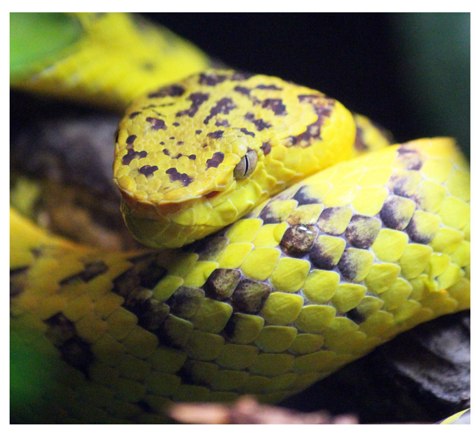
Figure 1: A male McGregor's pitviper, T. mcgregori in the herpetological collection at Audubon Zoo, New Orleans, Louisiana.

McGregor's pitviper, T. mcgregori (Fig. 1) is a poorlystudied polymorphic inhabitant of the Philippines that remains rare in captive collections outside of zoological parks in the United States, where it has been maintained since 1987 (ZIMS 2022). Formerly managed by an Association of Zoos and Aquariums (AZA) regional studbook (Dietz 2003), at least 149 captive-bred T. mcgregori offspring have been produced in AZA-accredited zoos since 1993 (ZIMS 2022); however, published accounts describing successful reproduction have been lacking. At Audubon Zoo, a male and three females were initially acquired from commercial distributors between 1989 and 1990; eggs were received from this group as early as 1992, with successful reproduction first occurring in 1999. Between 1999 and 2006, a total of 11 clutches of eggs were received from five females, of which four viable clutches produced a total of 23 live offspring. Historical