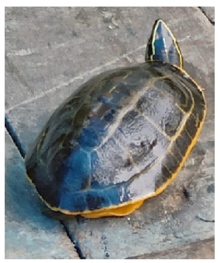
Fig. 1. The rescued Indian Eyed Turtle (Morenia petersi) from near Olamara GP, Balasore (KUDA 13795).

The locality record is close to West Bengal, lying on the left bank of River Subarnarekha (Fig. 2). The nearest locality record of this species is from Medinipur District, West Bengal (Mahapatra et al. 2020). A photo of an Indian Eyed Turtle was also obtained via the WhatsApp messenger platform from an anonymous source claiming to be from Olamara, Odisha, on 27 August 2020, however the exact locality of the photo