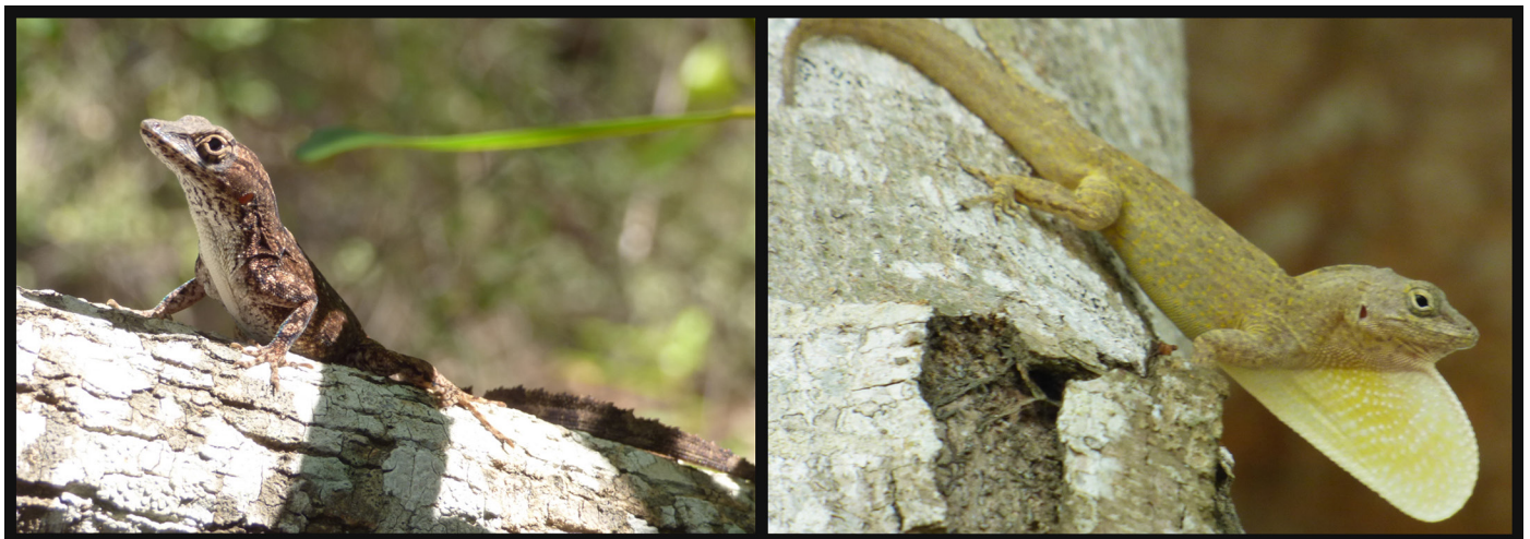
Fig. 3. Cuban White-fanned Anole ( Anolis homolechis ) (left) and Cuban Coast Anole ( Anolis jubar ) (right) from Naval Station Guantanamo Bay, Cuba.