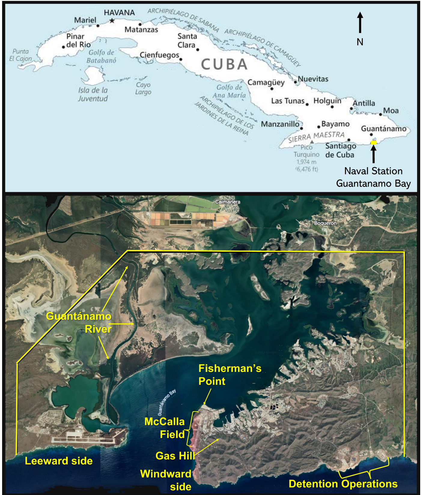
Fig. 1. Upper map indicates the location of Naval Station Guantanamo Bay (yellow), on the southeastern coast of Cuba. The lower map is of Naval Station Guantanamo Bay. Base boundaries are indicated by the yellow line. The easternmost boundary is 8 km in length.

Crocodile, Crocodylus rhombifer (Gundlach 1880; Barbour and Ramsden 1919). To further confuse things, true caimans