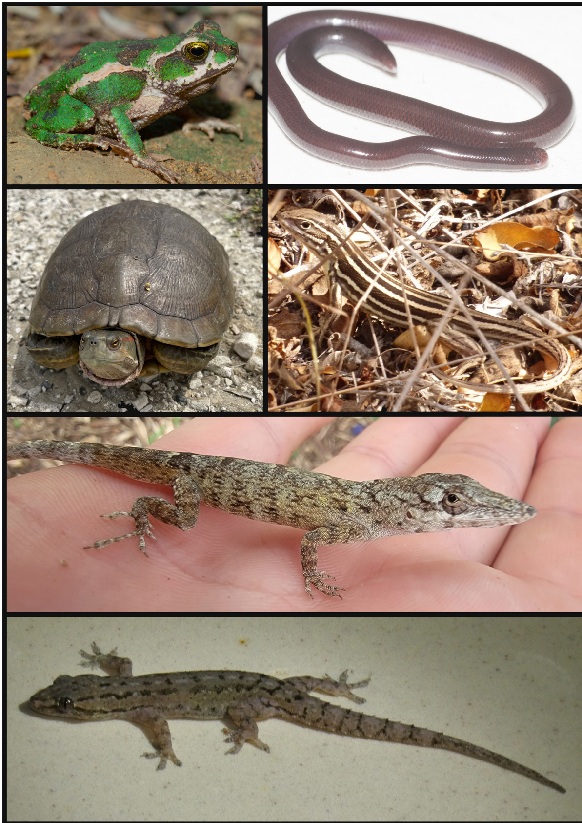
Fig. 2. Recently detected herpetofauna at Naval Station Guantanamo Bay, Cuba: Cuban Spotted Toad ( Peltophryne taladai ), Brahminy Blindsnake ( Indotyphlops braminus ), Cuban Slider ( Trachemys decussata ), Guantamo Striped Curlytail ( Leiocephalus onaneyi ), Cuban Twig Anole ( Anolis angusticeps ), and Common House Gecko ( Hemidactylus frenatus ).