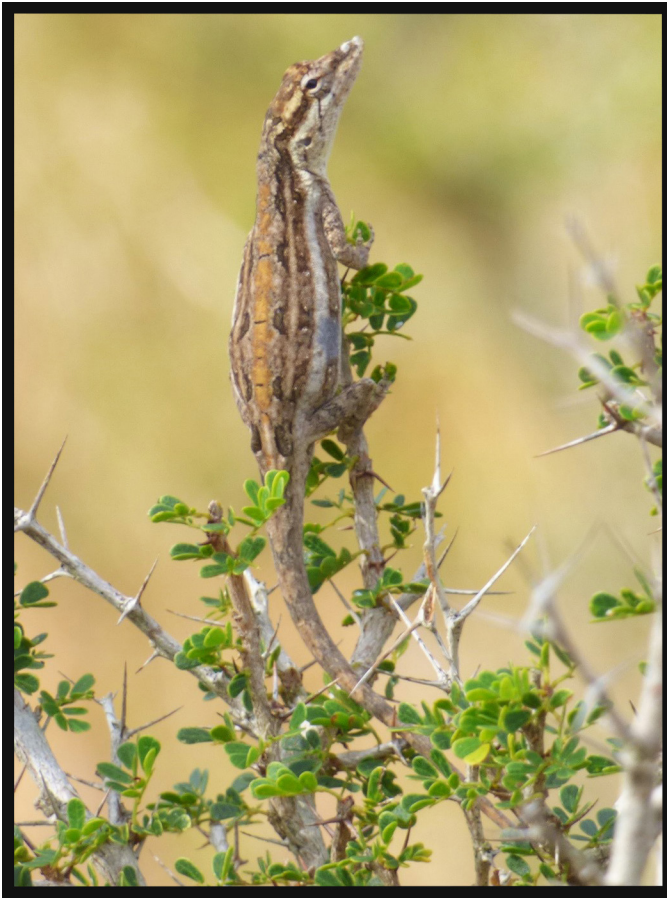
Fig. 4. Oriente Pallid Anole ( Anolis litoralis ) from Naval Station Guantanamo Bay, Cuba.

69421, 141463, 172058) were ascribed to Anolis litoralis , which included the Lando and Williams (1969) specimen. The range of Anolis centralis no longer includes Guantánamo Province; however, that of Anolis argillaceus does, although not along the southeastern coast (Navarro Pacheco et al. 2001). The two species differ in the shape of the ear opening, either oval with a posterior skin fold ( Anolis litoralis ) or small and circular ( Anolis argillaceus ), and dewlap color, yellow ( Anolis litoralis ) or pale orange ( Anolis argillaceus ) (Batista-Alvarez and Iturriaga 2020).