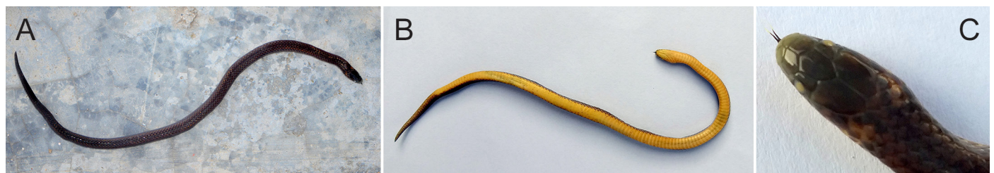
Figure 1. An Assam Hill Wormsnake ( Trachischium monticola ) (APRC/R-185): Dorsal (A) and ventral (B) views and dorsal view of the head showing the yellowish band (C).