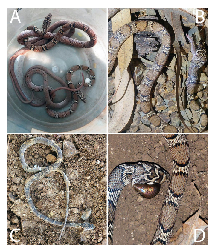
Figure 1. Two Graceful Racers (Platyceps gracilis) rescued from the Valley of Flowers, Kevadiya, Garudeshwar Taluka, Narmada District, Gujarat, India (A); a Graceful Racer feeding on a Little Indian Field Mouse (Mus booduga) at the Narmada Dam, Kevadiya, Garudeshwar Taluka, Narmada District, Gujarat, India (B); a dead Graceful Racer found near the Statue of Unity, Kevadiya, Garudeshwar Taluka, Narmada District, Gujarat, India (C); a Graceful Racer feeding on a Bronze Grass Skink (Eutropis macularia) in the Shoolpaneshwar Wildlife Sanctuary, Vandari, Dediapada Taluka, Narmada District, Gujarat, India (D).

Patel and Vyas (2019) recently gathered evidence and specimens from southern, central, and northern Gujarat, although no specific locations are mentioned in their report.