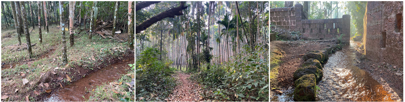
Figure 2. Habitat of Castoe's Coralsnake ( Calliophis castoe ) from Pendkhale, Rajapur, Maharashtra, India.