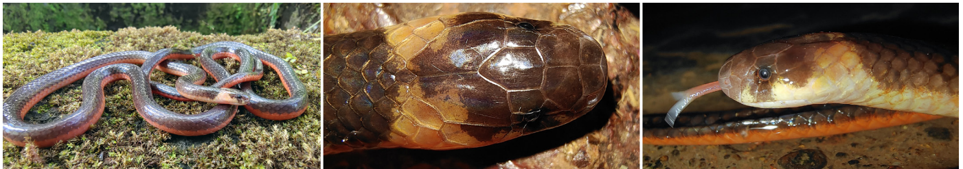
Figure 3. Castoe's Coralsnake ( Calliophis castoe ) rescued from Pendkhale, Rajapur, Maharashtra, India.