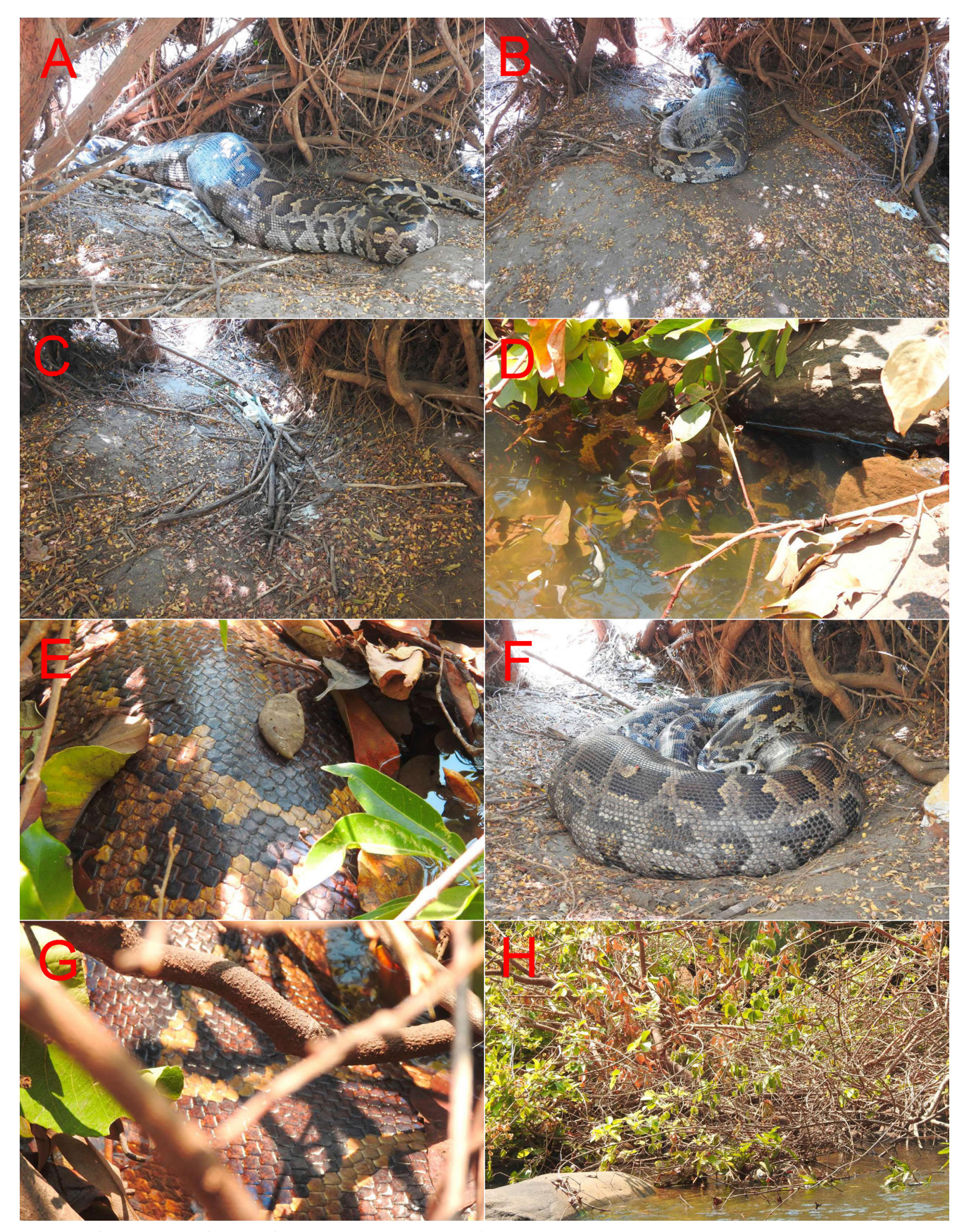
Figure 2. Post-feeding activity of an adult female Indian Rock Python ( Python molurus ): Feeding event recorded on 13 March 2019 (A); three days later on 16 March 2019 in the same area (B); left the area on 17 March 2019 (C); along the bank of the Moyar River on 17 March 2019 (D); again in the water on 21 March 2019 (E); returned to the area where the feeding event occurred on 22 March 2019 (F); again in the water on 23 March 2019 (G) and on 29 March 2019 (H).