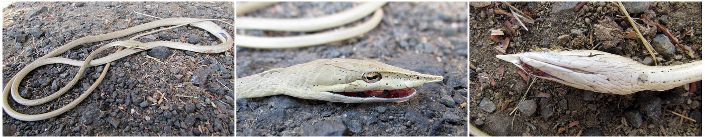
Figure 2. A road-killed Laudankia Vinesnake ( Ahaetulla laudankia ) from The Dangs District, Gujarat, India (KUDA 13923–5). Photographs by Dikansh S. Parmar.