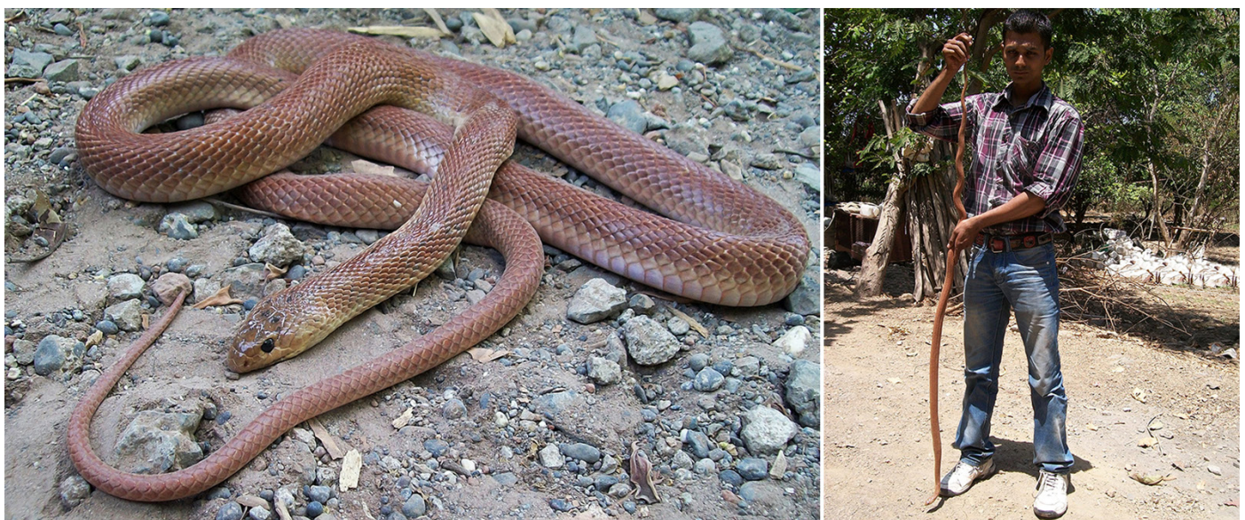
Figure 1. Longest recorded Banded Racer ( Platyceps plinii ) (KUDA 13922) from Khajod, Gujarat, India (left); DSP holding the snake, note that the curved body of the snake indicates that it is slightly longer (1,853.6 mm) than the author is tall (175 cm) (right).

We found a road-killed adult male of the recently described Laudankia Vinesnake, Ahaetulla laudankia Deepak, Narayan, Sarkar, Dutta, and Mohapatra 2019, at 1700 h on 8 March 2012 on the Purna-Mahal Road outside the Purna Wildlife Sanctuary, The Dangs District, Gujarat, India (20.943367 N, 73.724249 E) (Fig. 2). At 0850 h on 23 May 2023, we also sighted a subadult in the Purna Wildlife Sanctuary (20.923811 N, 73.656654 E) but were unable to capture or photograph it before it fled into nearby vegetation. Based on morphology, morphometrics, and scalation we identified the roadkill as Ahaetulla laudankia , which was con-