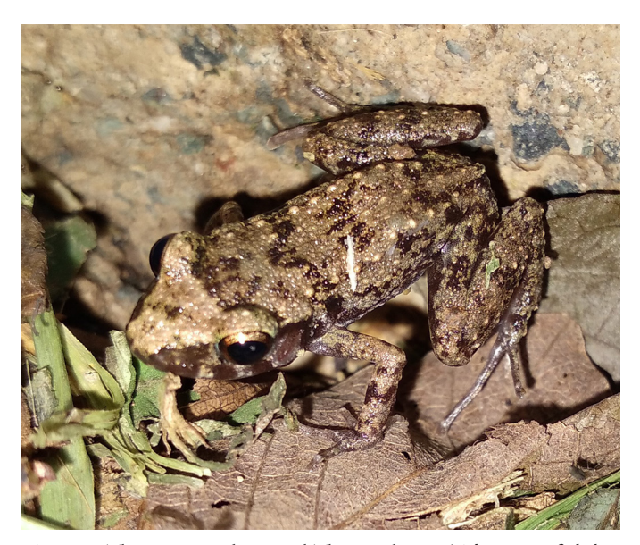
Figure 1. The Lesser Dark-spotted Thin-toed Frog (Adenomera cf. hylaedactyla) observed on 3 June 2023 on Tobago.

Two additional potential records of frogs identified as Adenomera on Tobago were observed by authors of this report on 18 August 2022 (https://www.inaturalist.org/observations/140089949) and 22 October 2022 (https://www. inaturalist.org/observations/140060168). The frog observed on 18 August 2022 was seen at 2359 h at Corbin Wildlife Sanctuary in Mason Hall, Tobago (11.20150 N, 60.70510 W). The habitat in the area is predominantly secondary for-