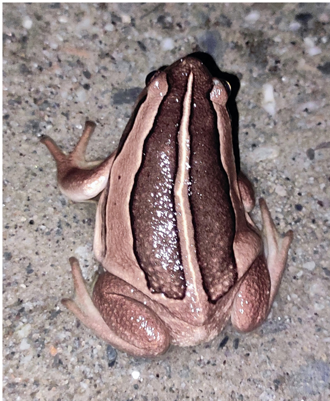
Figure 1. An Assam Painted Frog ( Uperodon assamensis ) from the Bhuyanpara Range of Manas National Park, Assam, India.

At about 2100 h on 9 April 2022, we encountered an individual U. assamensis during heavy rain on a concrete surface of a basement about 0.3 m above the ground in the outskirts of the Bhuyanpara Range of Manas National Park, Assam (26.7582, 91.2119; Fig. 2). This is the first record of the species from Manas National Park and is about 6 km south of the Indo-Bhutan border. A photographic voucher was deposited at the Lee Kong Chian Natural History Museum, National University of Singapore (ZRC(IMG) 1.269) and the identity of the species was confirmed from a photograph by Sanath Bohra.