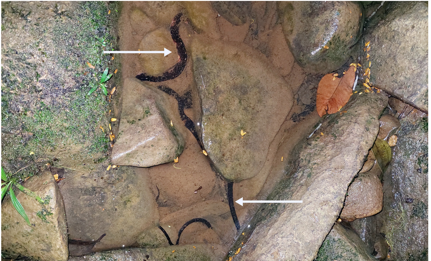
Figure 1. An Ecuador Sipo ( Chironius grandisquamis ) fully submerged in a stream (arrows indicate parts of the body) near El Cantar Trail, Chagres National Park, Panamá.

80.139234°W; elev. 694 m asl) (Fig. 2A). Exposure to a 395 nm blacklight while eating an earthworm (Fig. 2B) revealed fluorescence of upper cephalic scales and a banded body pattern resembling that of congeners (i.e., G. brachycephalus , G. talamancae , and G. tectus ), which might be an example of Batesian mimicry of coralsnakes. Kikuchi and Pfennig (2010) demonstrated that even imperfect mimicry can be successful if registered by a predator's cognitive capabilities. Fluorescence has been reported in another dipsadid,