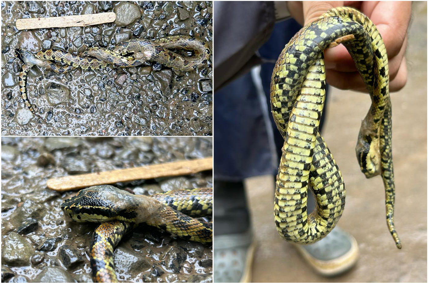
Figure 2. A road-killed subadult Kaulback's Lance-headed Pitviper ( Protobothrops kaulbacki ) from Kigwema Village, Kohima, Nagaland, India.