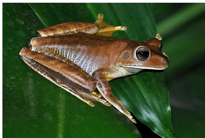
Figure 1. An adult Blacksmith Treefrog ( Boana faber ) in an urban area of Ritópolis, Minas Gerais, Brazil.