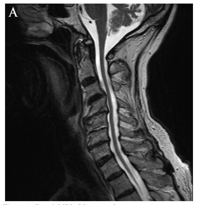
B A A A: 0.43 cm