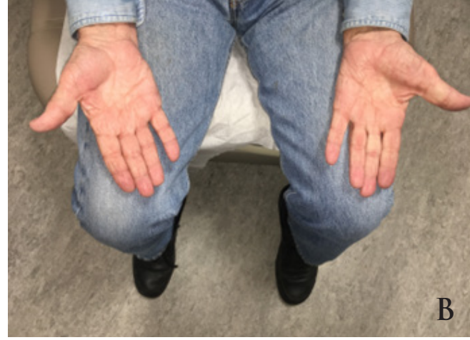
Figure 1 : Case 1 with A) left greater than right first dorsal interossei (FDI) atrophy, B) left greater than right thenar atrophy, and C) prominent tongue atrophy