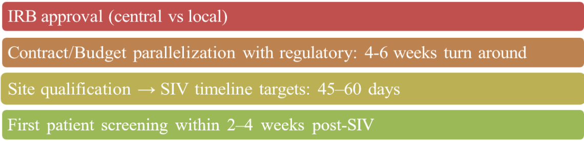
Figure 5. Study Start-Up Timeline

Shows the streamlined activation steps and timeline.